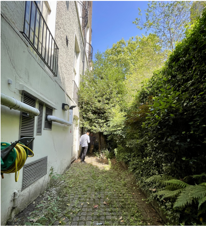
3 Photo of rear courtyard looking northwest showing one of the trees to be removed.