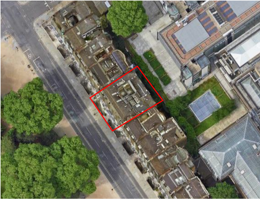
2 Aerial Photograph