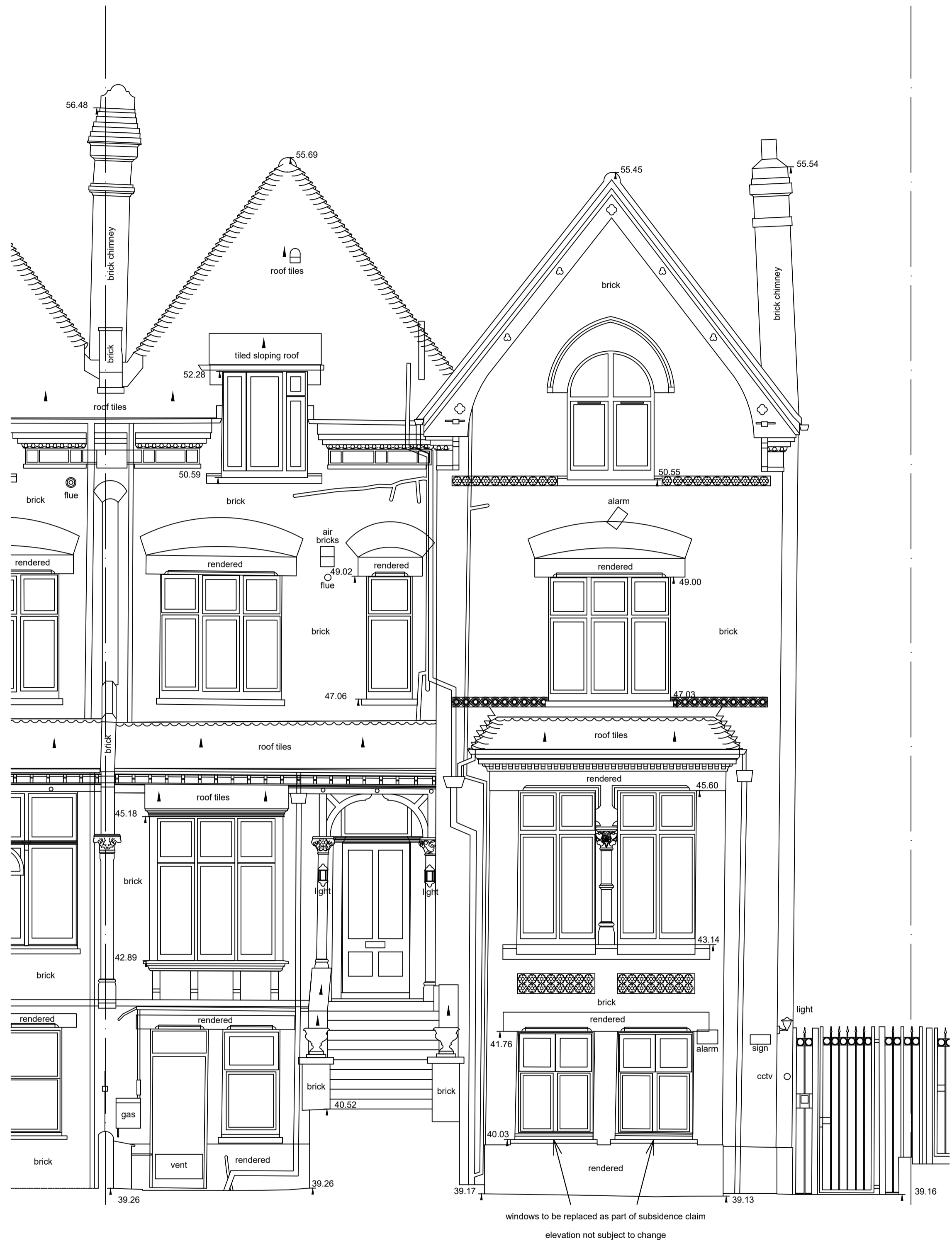
Front Elevation - Building