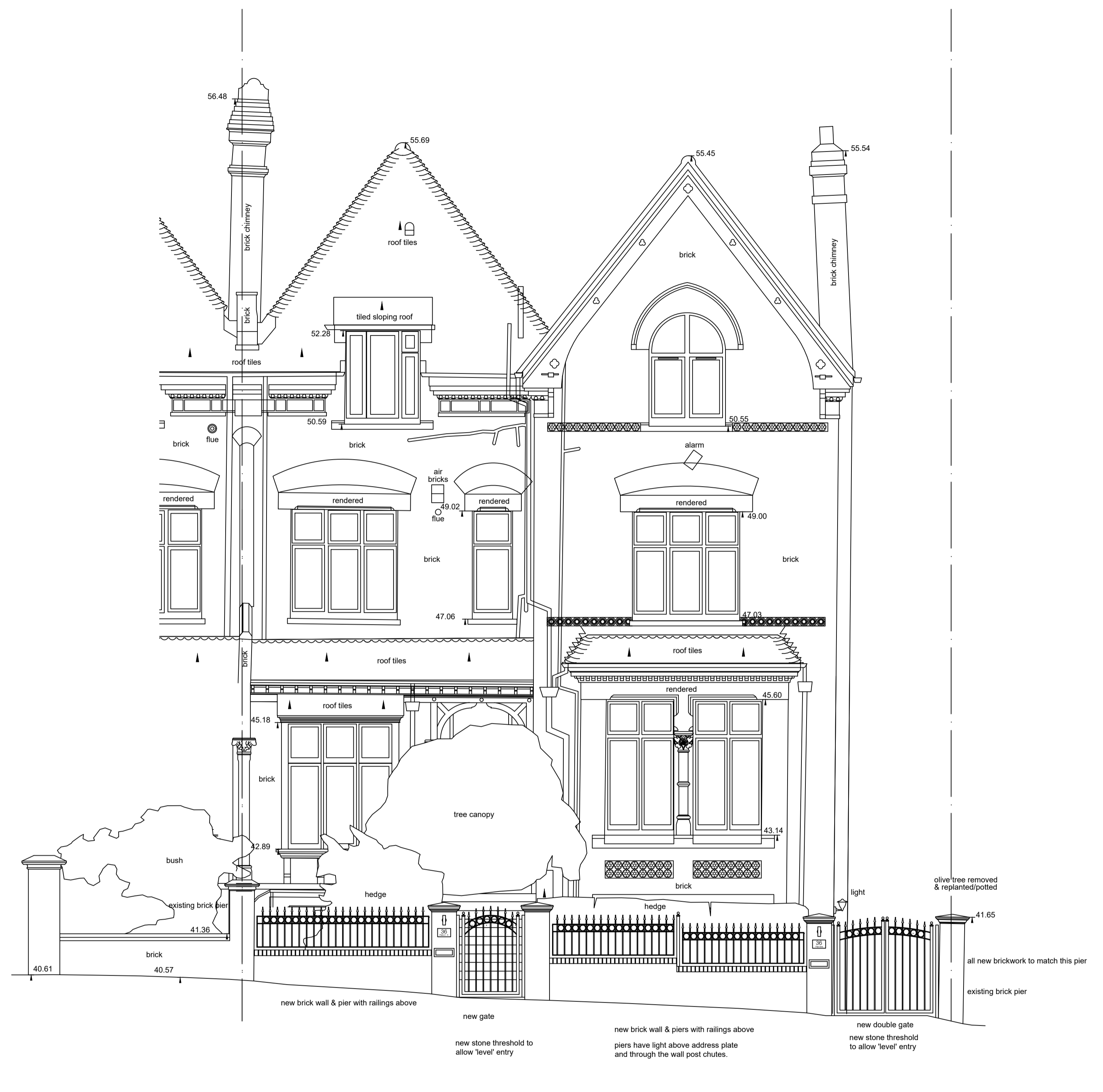
Front Elevation - New Front Boundary Wall