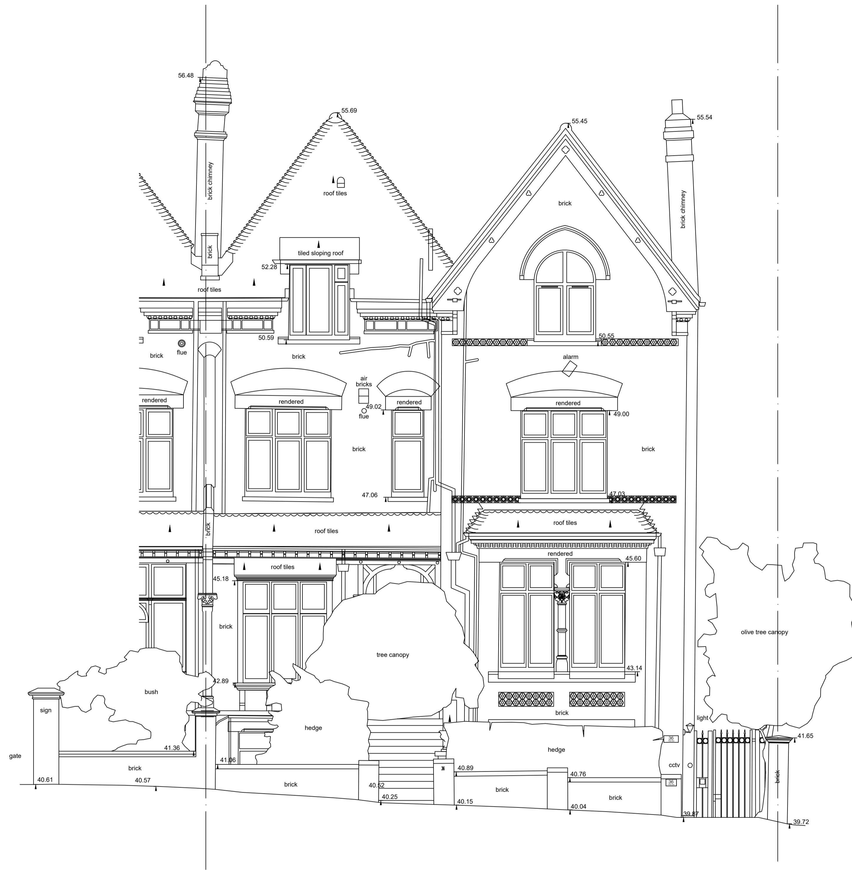
Front Elevation - Front Boundary Wall