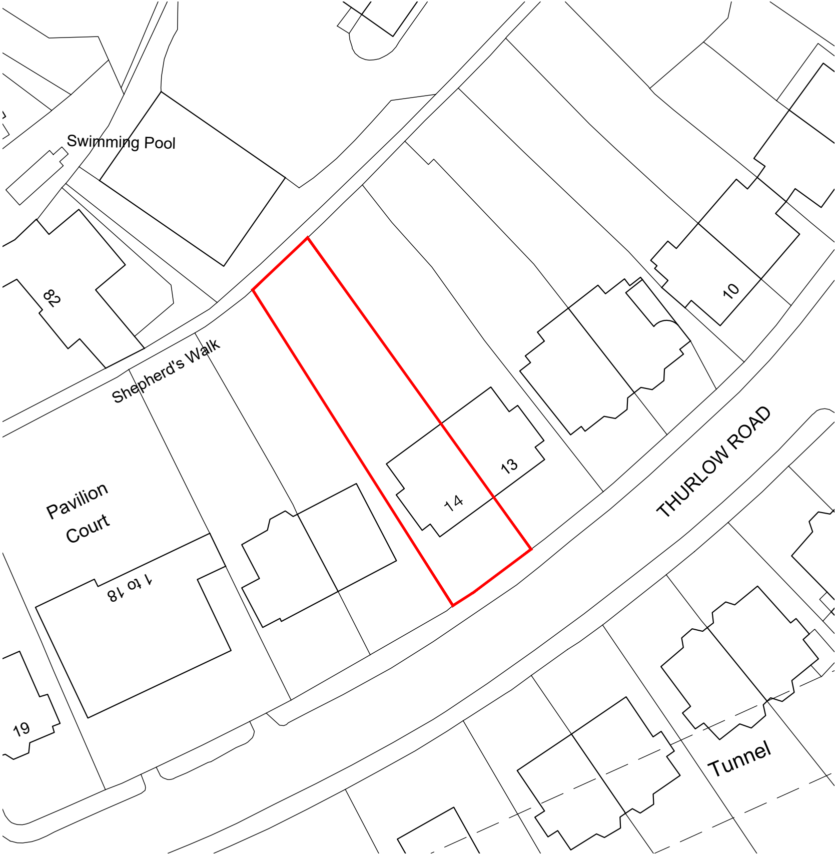
X EXISTING Block Plan 1:500@A3