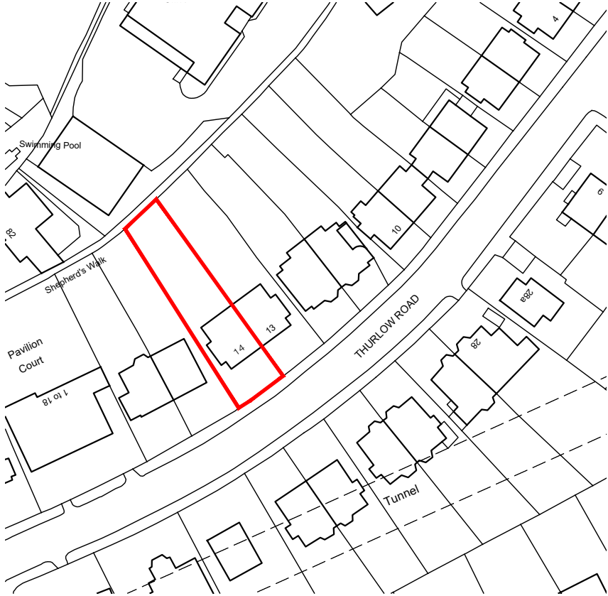
X EXISTING Site Location Plan 1:1250@A3