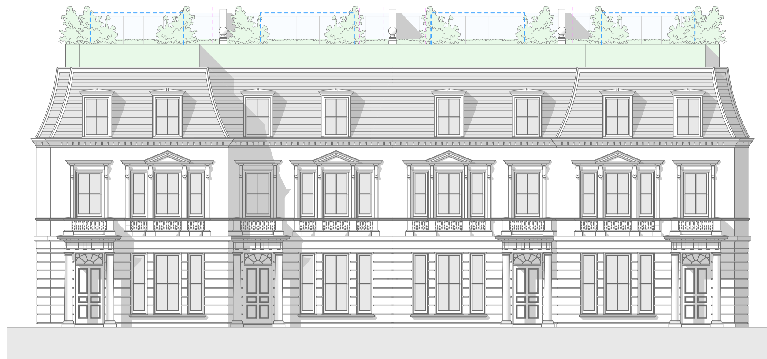
ELEVATION 1 0 2 4 6 8 10M

KEY - - - - - APPROVED OVAL STAIR ACCESS - - - - - APPROVED LIFT ACCESS