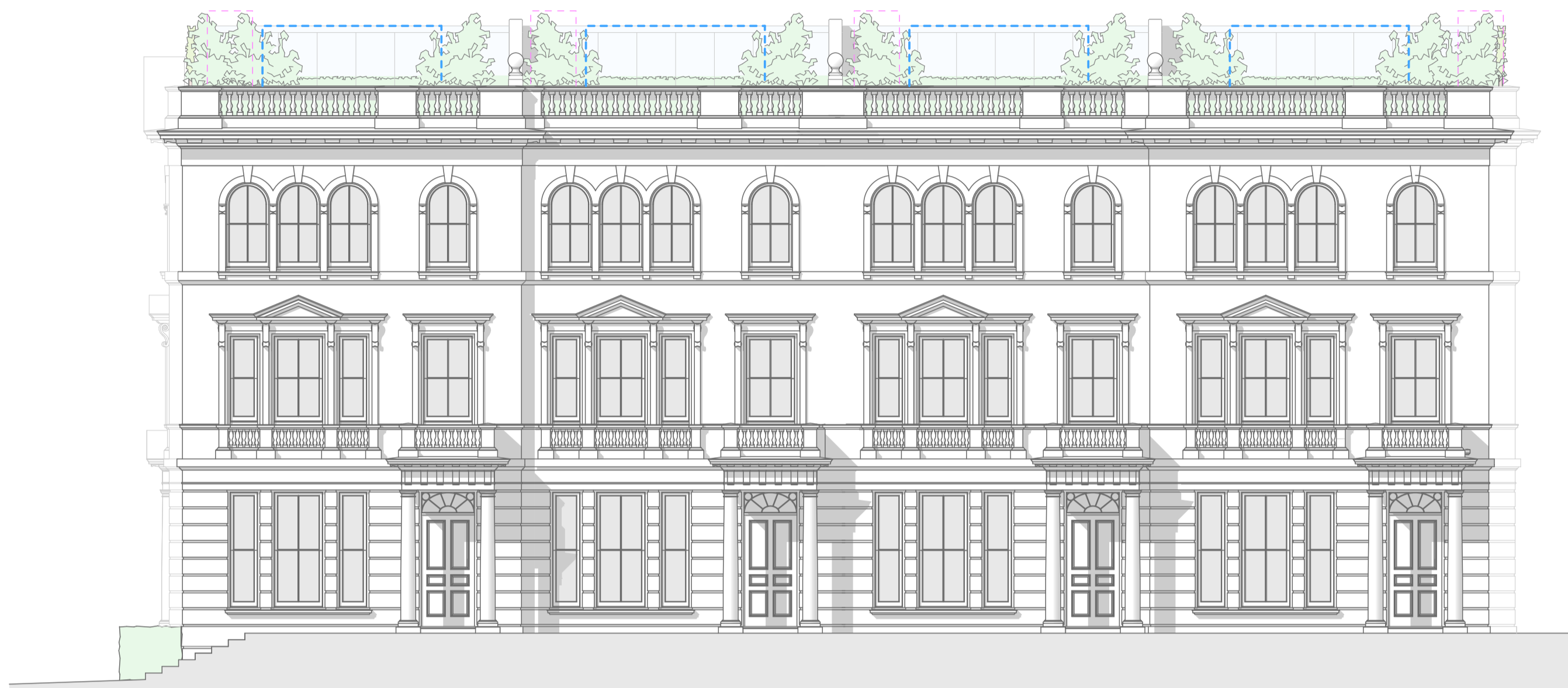
ELEVATION 1 0 2 4 6 8 10M

KEY - - - - - APPROVED OVAL STAIR ACCESS - - - - - APPROVED LIFT ACCESS