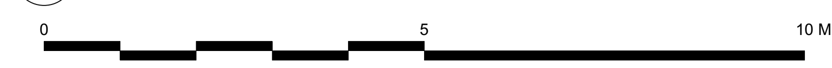
02 Existing Second Floor Plan Scale: 1:50 @A1

Subsidiary A2 APPROVED FOR PLANNING STAGE