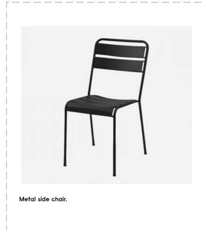
Metal side chair.