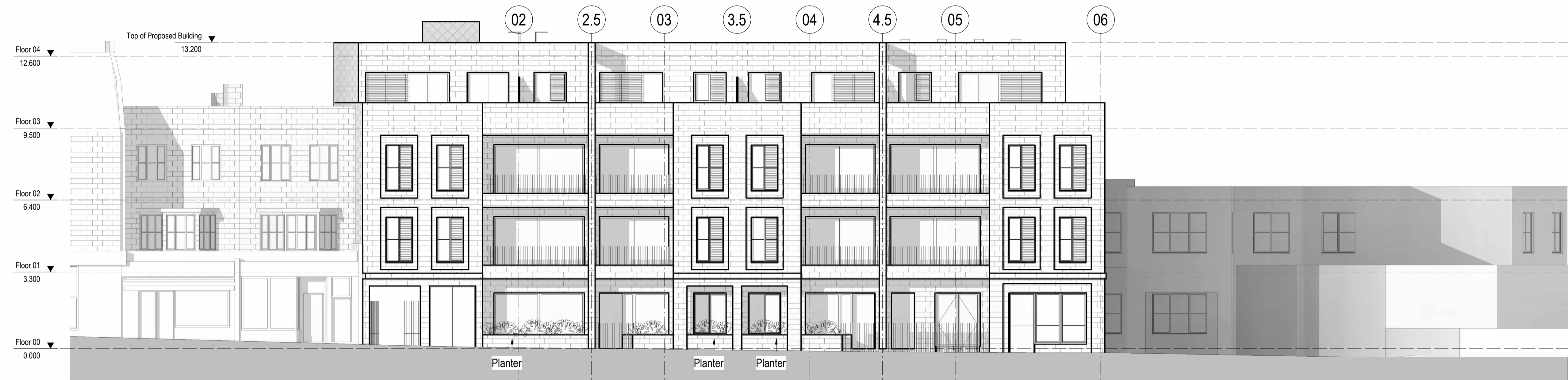
3 Master Elevation 03 1 : 100