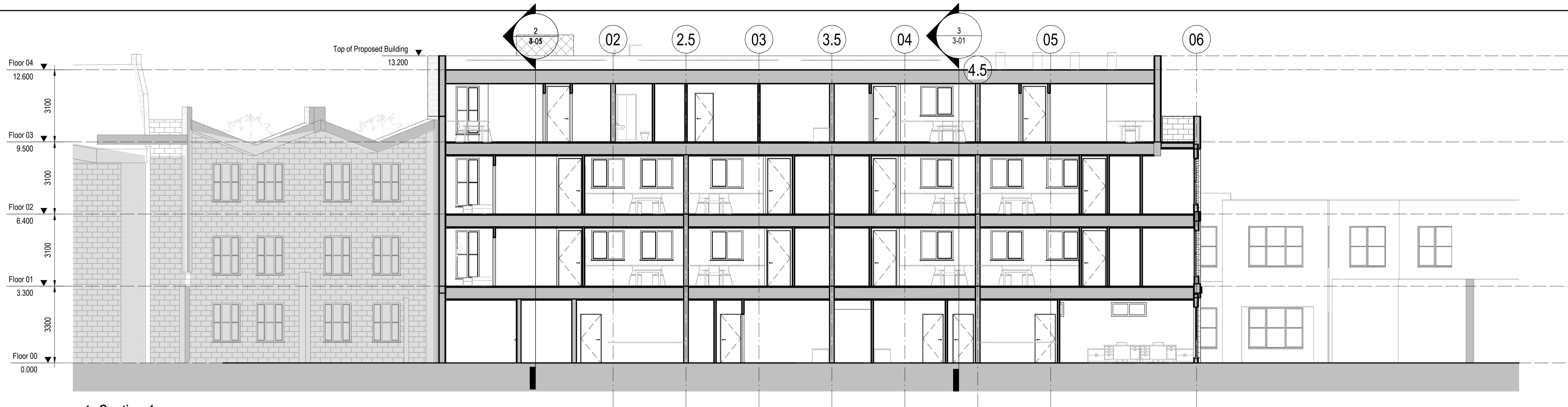
1 Section 1 1:100