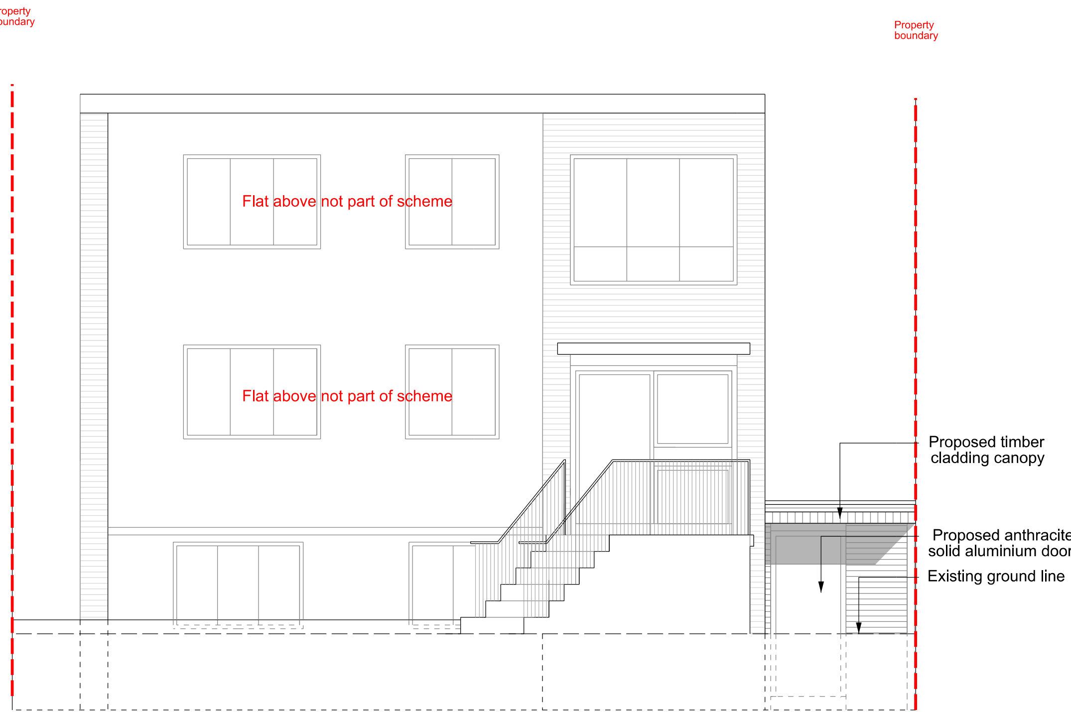
04 Front Elevation

There are no parking spaces located on the site and no alterations to any parking provisions are proposed