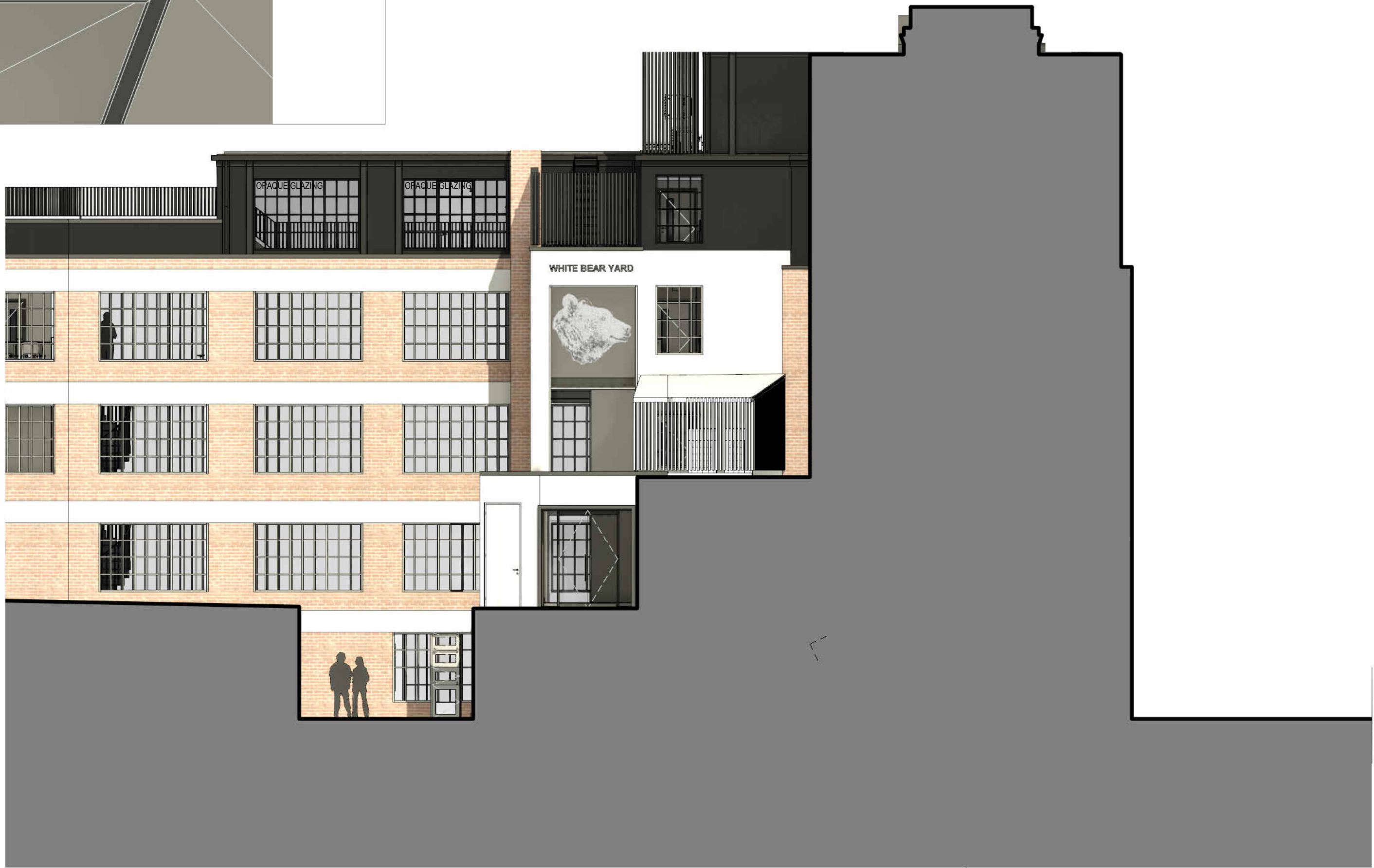
3 Proposed South Elevation with Plant Deck 1 : 100