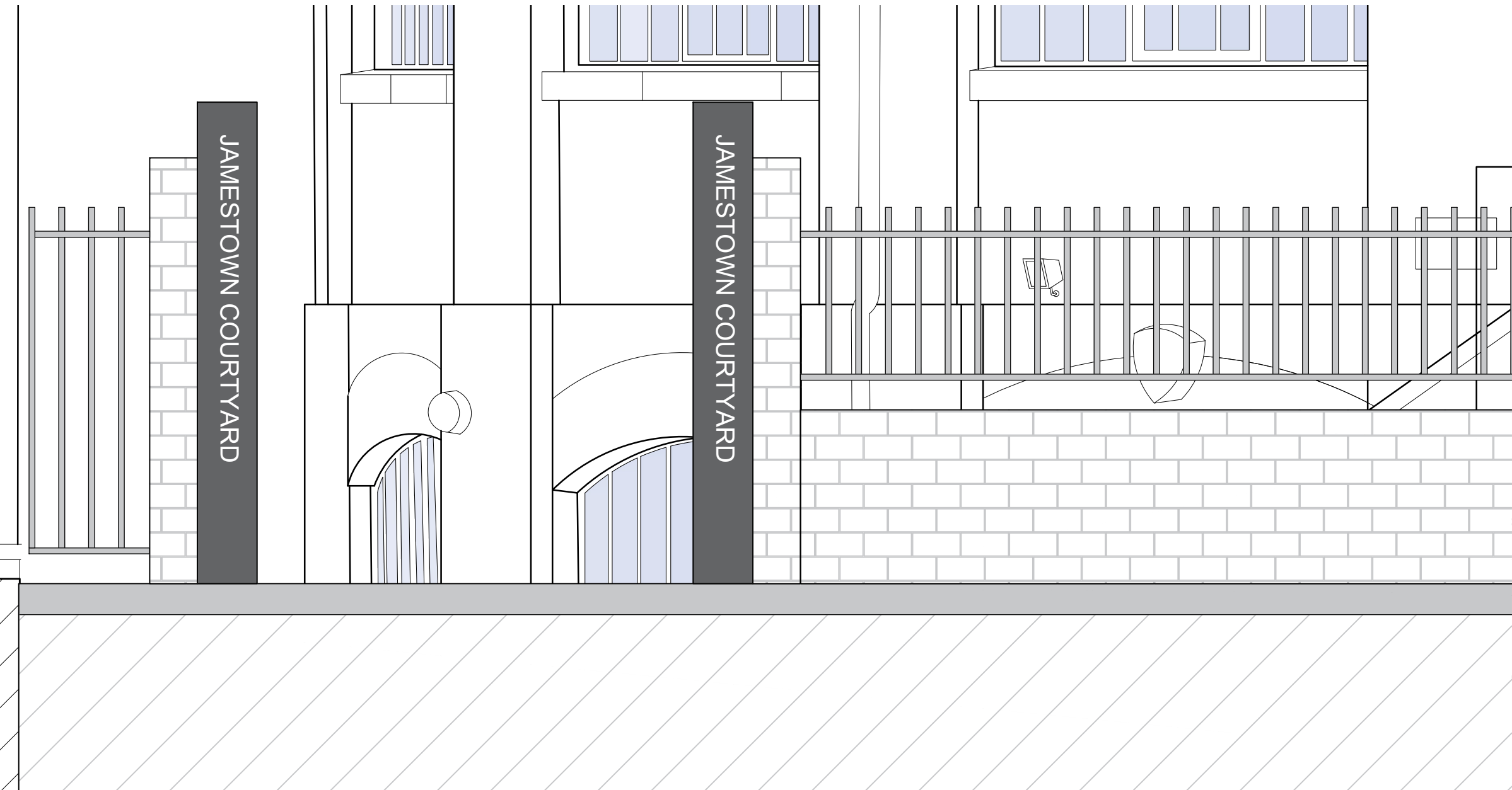
02 | Oval Road Entrance 490 | 1:20