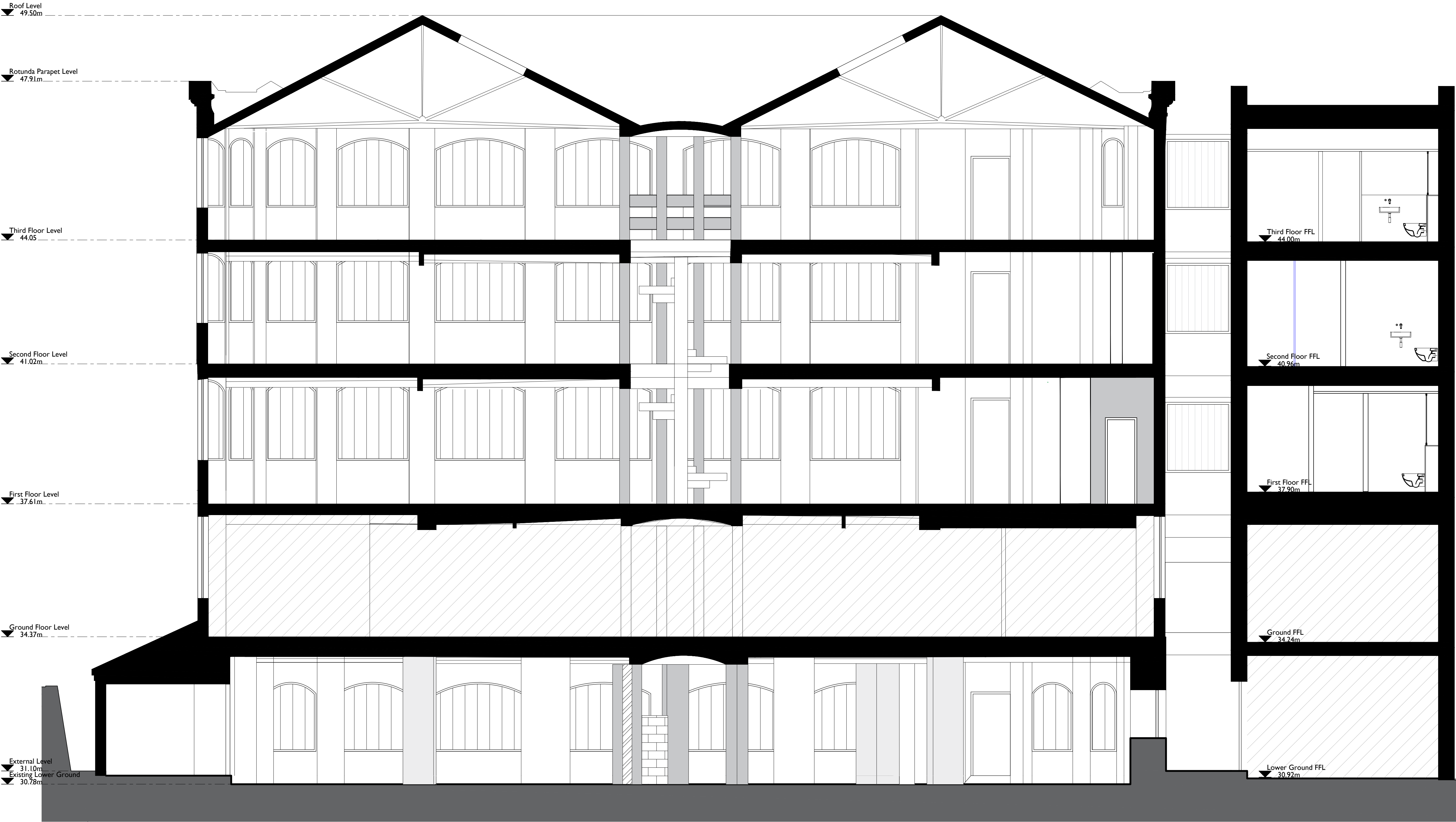
01 Section AA ZZ-300 1:50