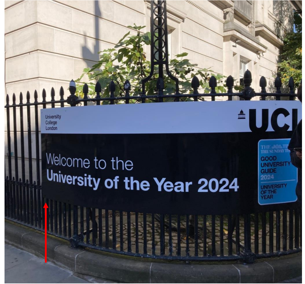
Height from ground: 470mm