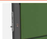
Eurocylinder Lock (Sliding Doors)