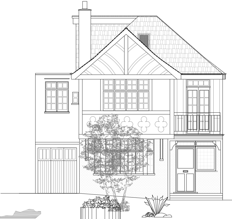
1 FRONT ELEVATION Scale 1:100 @ A3