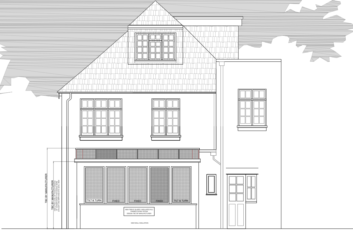
3 PROPOSED BACK ELEVATION Scale 1:100 @ A3