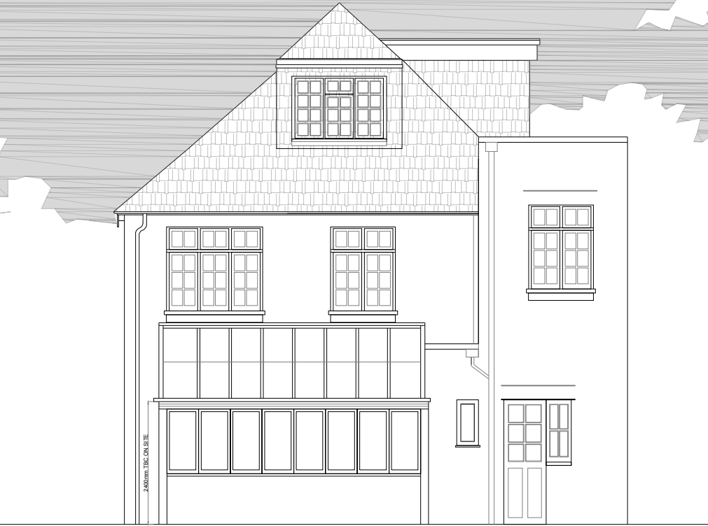
2 EXISTING BACK ELEVATION Scale 1:100 @ A3