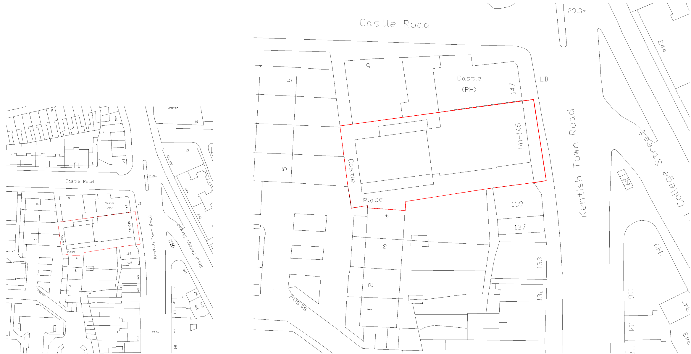
EXISTING LOCATION PLAN 1:1250