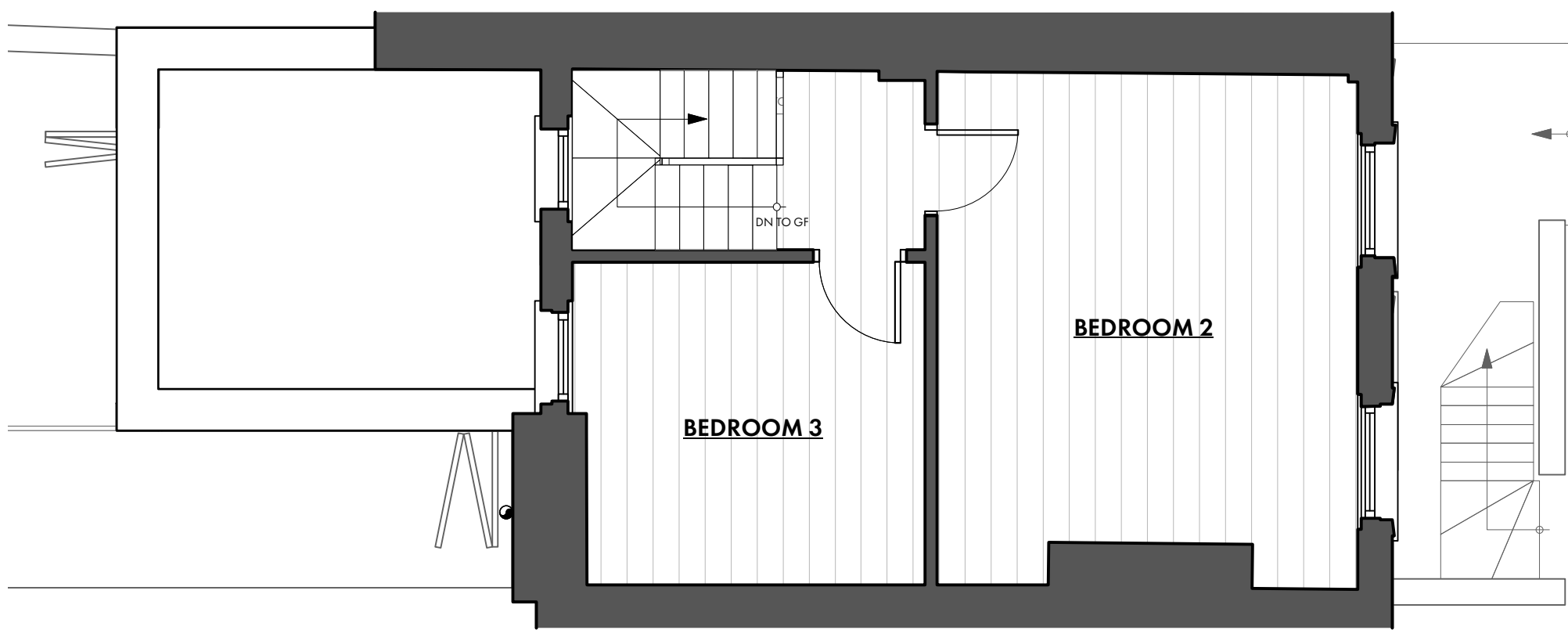
4 EXISTING 2F PLAN Scale: 1:50