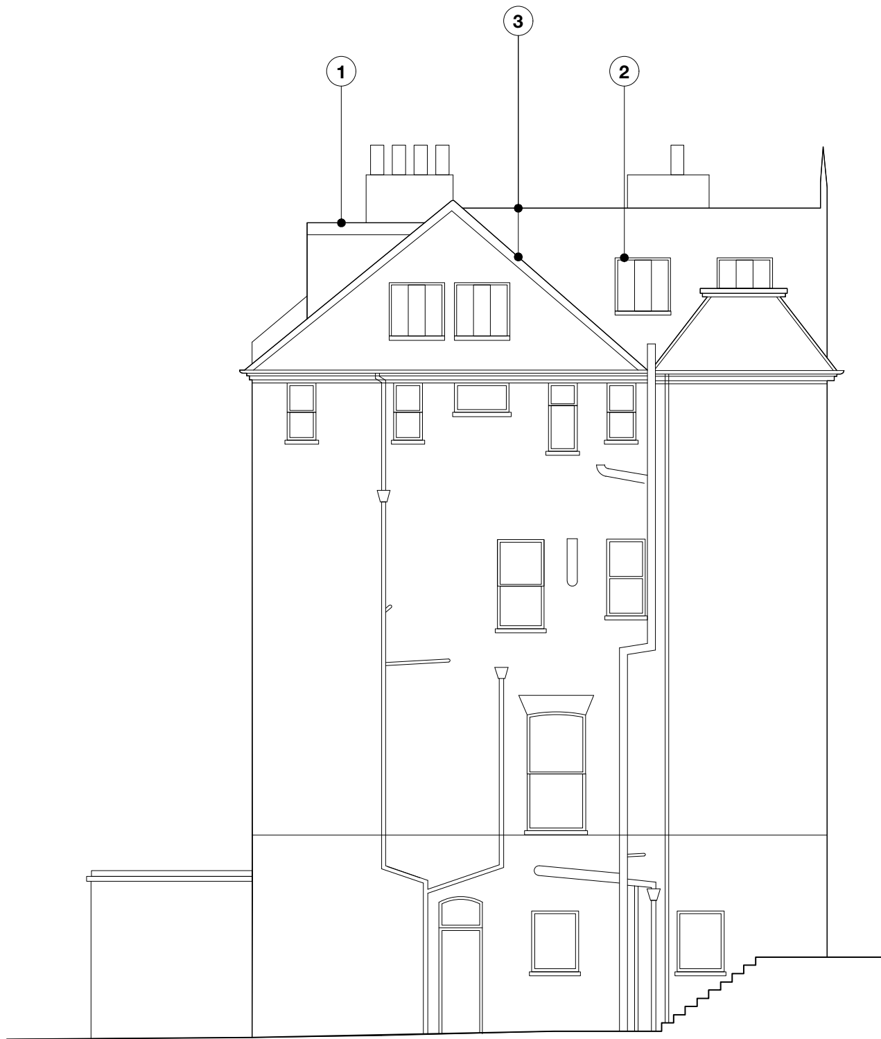
1 Existing Side Elevation