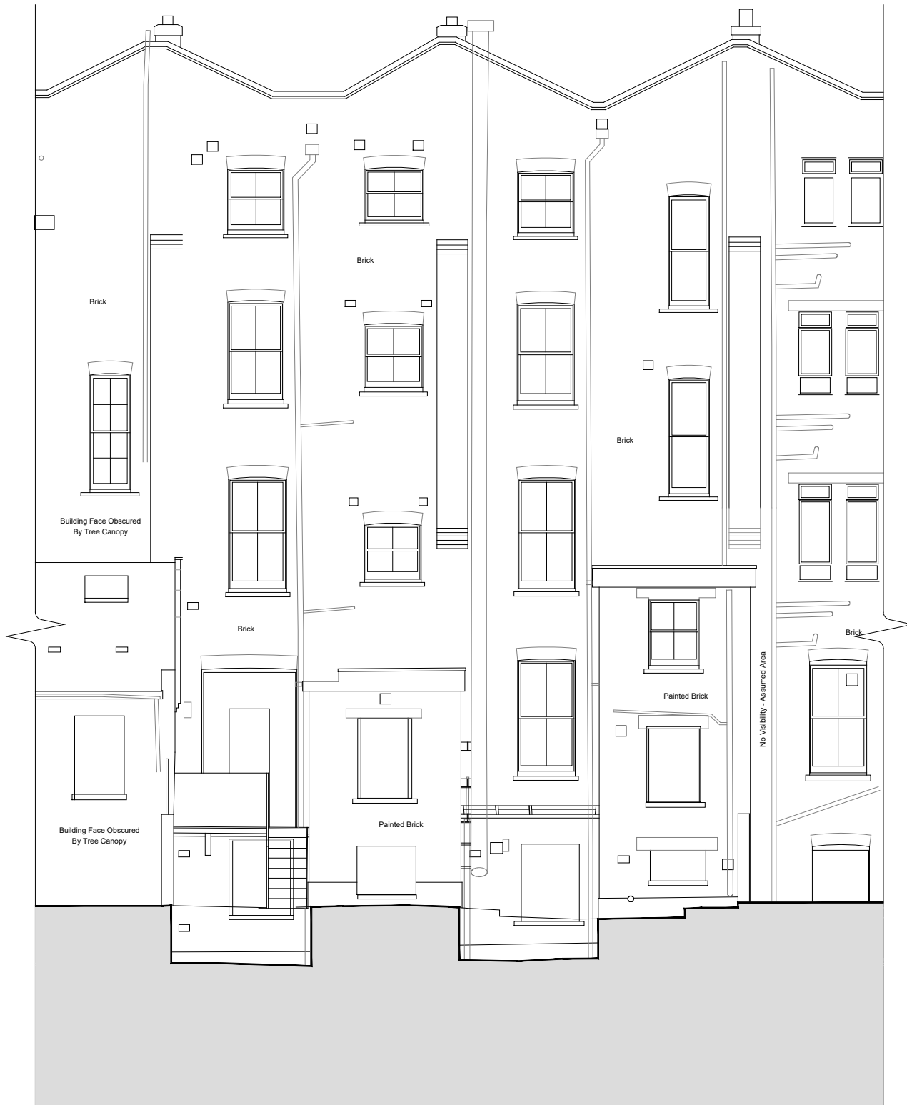
Existing south facing elevation