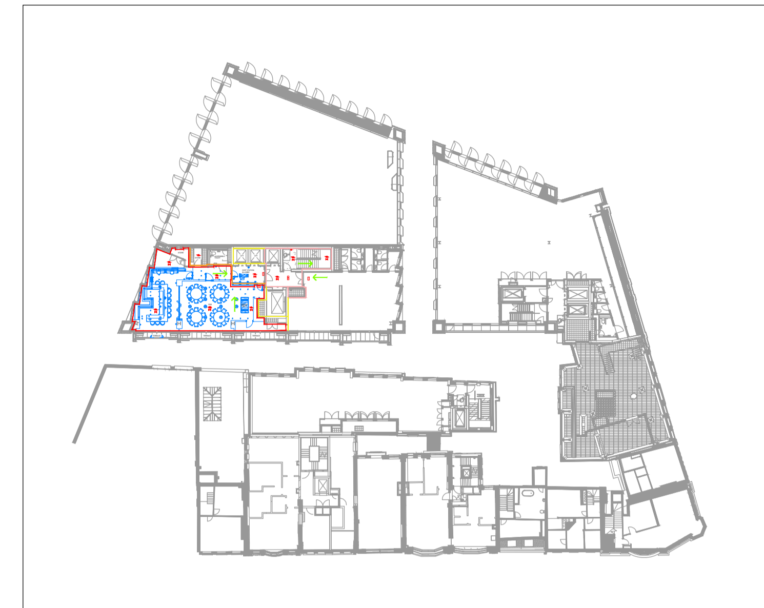
THIRD FLOOR KEY PLAN 1:500 @ A1 0 5 10 15 20m