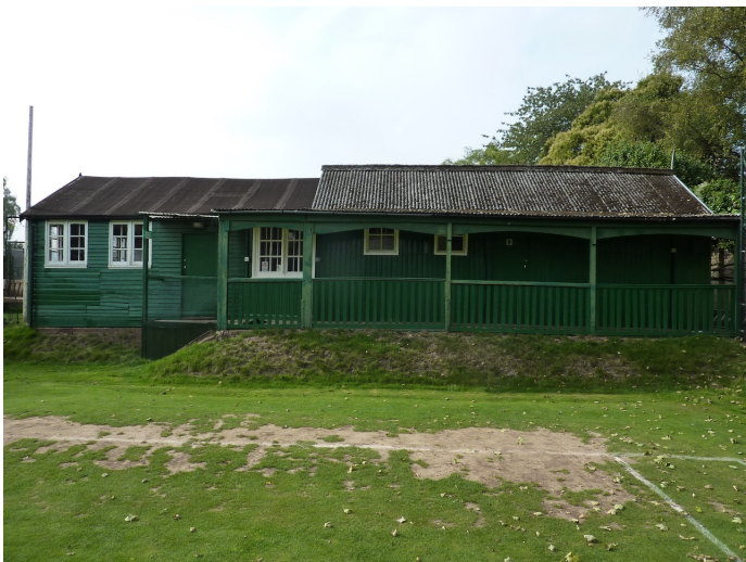
④ East Front Elevation