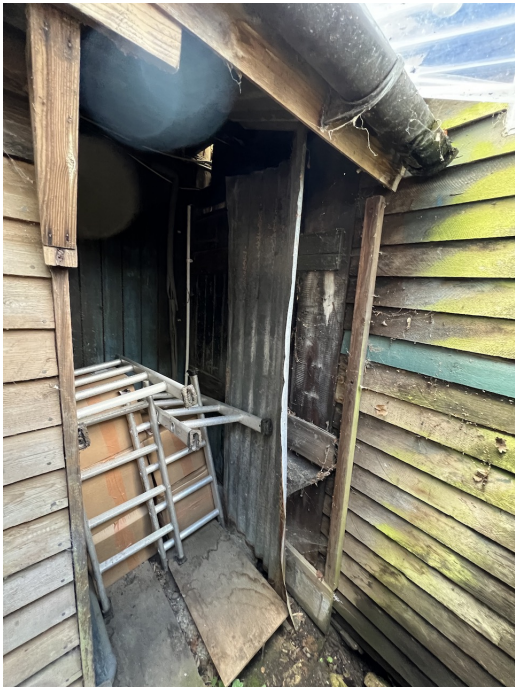
② Open Store at West Side with corrugated bitumen roofing sheet above