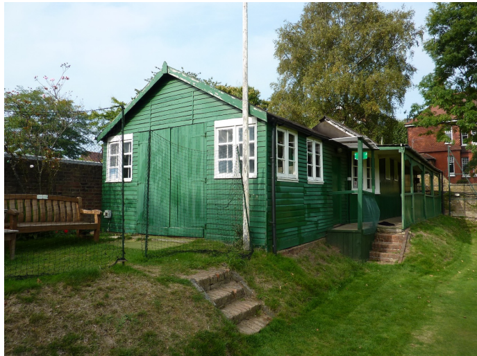
① South Side Elevation