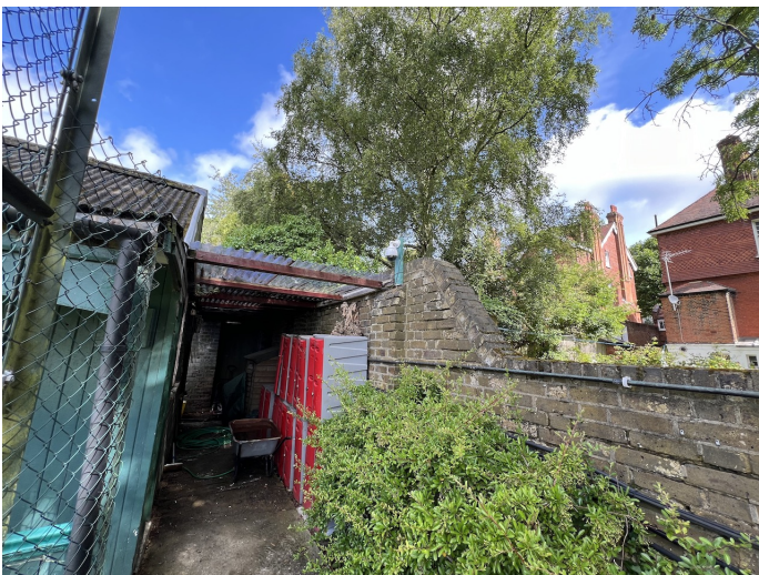
⑥ Open Store at North Side with corrugated PVC roofing sheet above