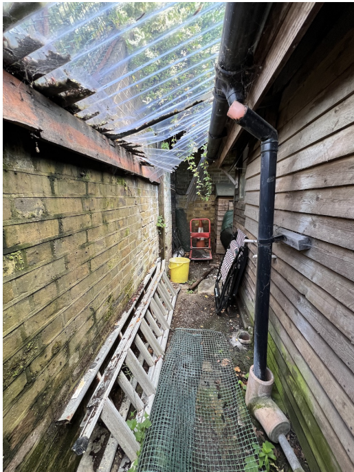
③ Open Store at West Side with corrugated PVC roofing sheet above