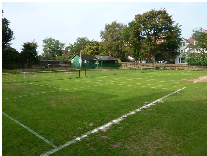
⑦ Lawn Tennis Court View