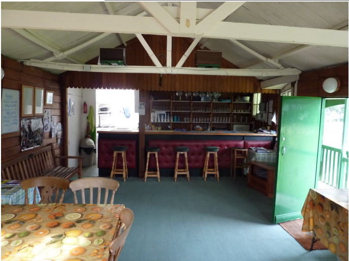
④ Club House Interior