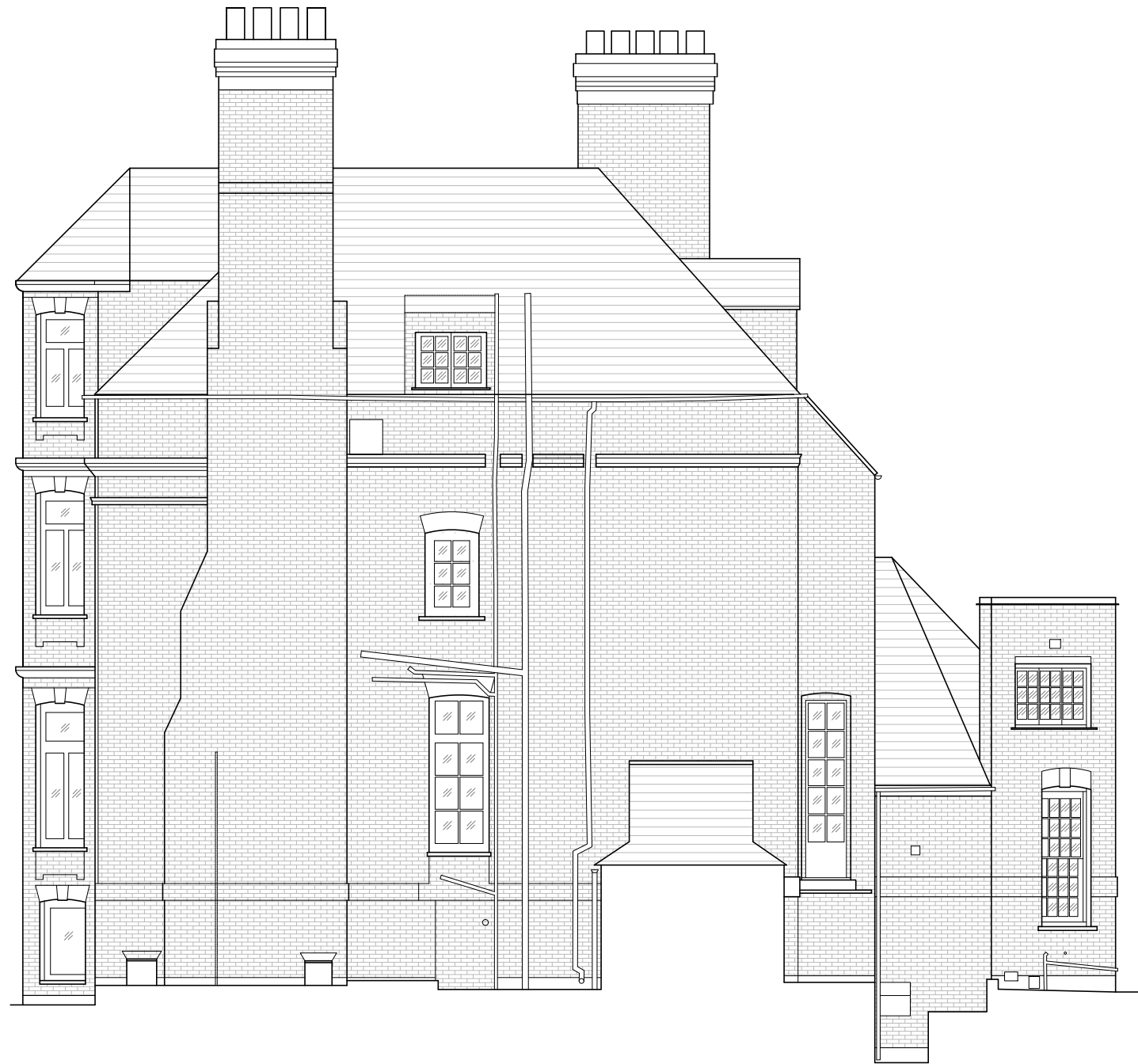
Existing Side Elevation (Northeast) Scale 1:100 @ A3