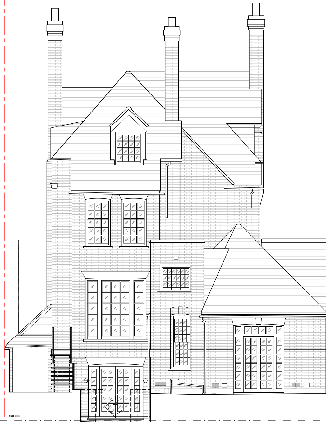
Existing Back Elevation Scale 1:100 @ A3