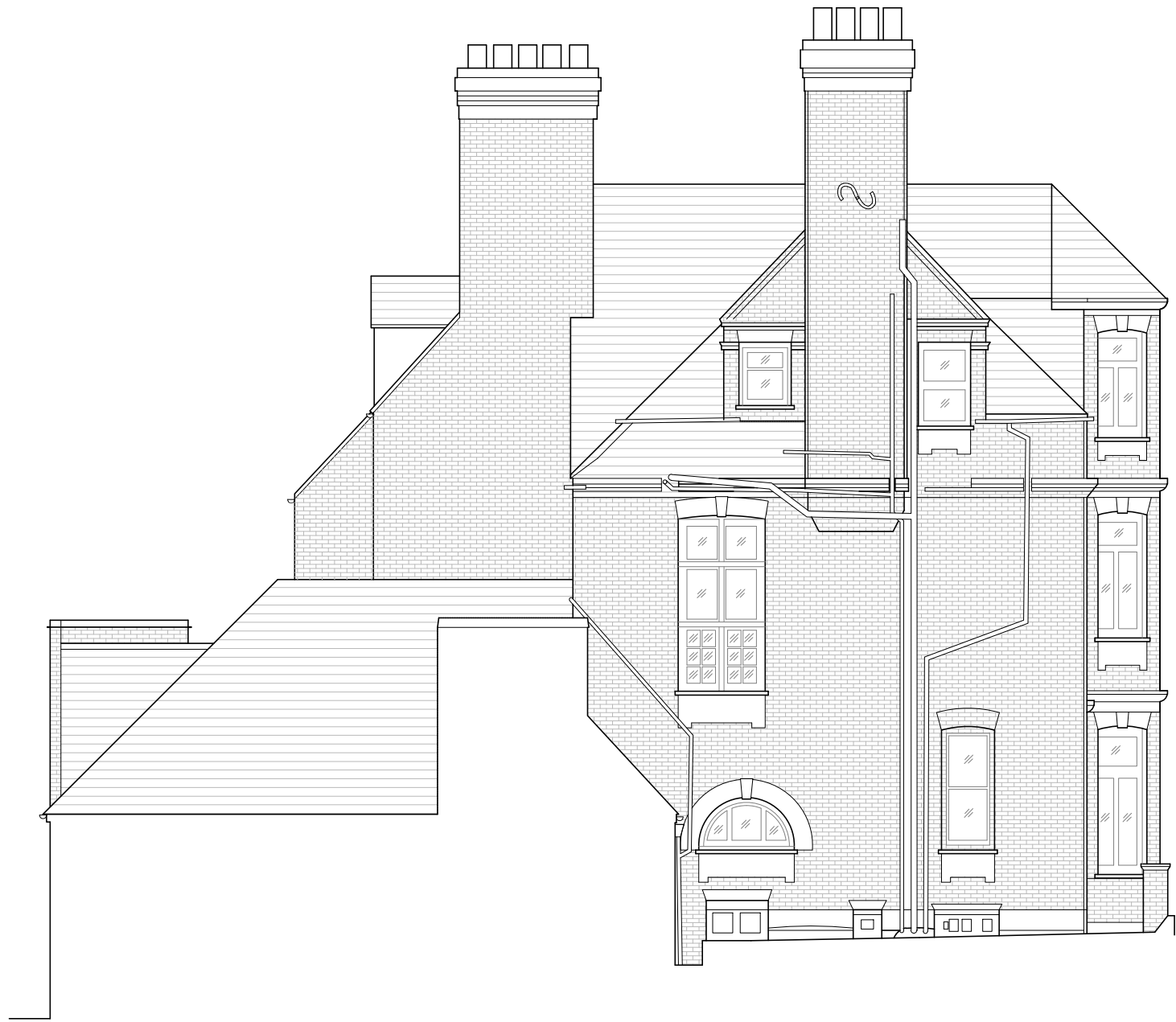
Existing Side Elevation (Southwest) Scale 1:100 @ A3