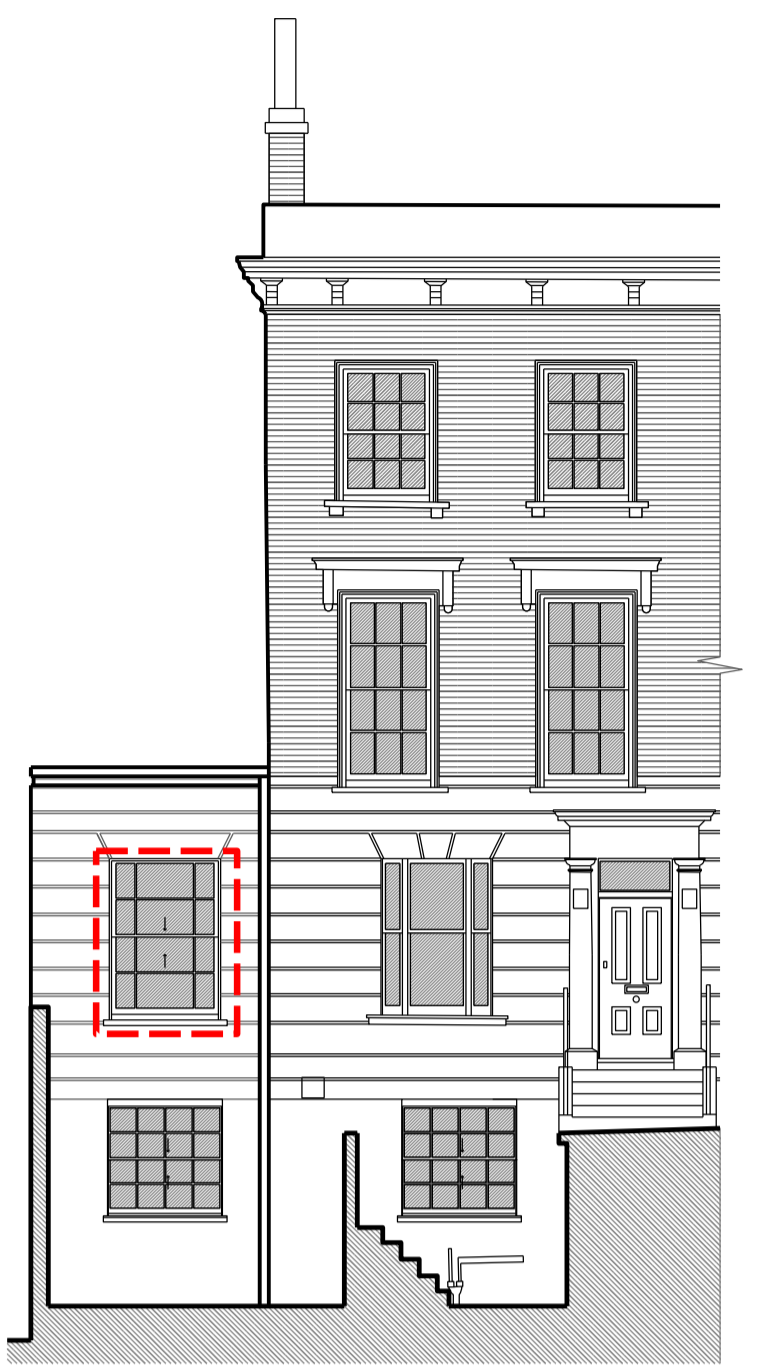
6 1:100 @A1. PROPOSED FRONT ELEVATION KEY PROPOSED GROUND FLOOR WINDOW

THIS DRAWING TO BE READ IN CONJUNCTION WITH THE SPECIFICATION WHERE PROVIDED AND ALL RELEVANT CONSULTANTS DRAWINGS AND/OR SPECIALIST DRAWINGS (DOCUMENTS AND ANY DISCREPANCIES OR VARIATIONS ARE TO BE REPORTED TO THE ARCHITECT BEFORE THE AFFECTED WORK COMMENCES. THIS DRAWING IS PROTECTED BY COPYRIGHT AND MUST NOT BE COPIED OR REPRODUCED WITHOUT THE WRITTEN CONSENT OF CHRIS DYSON ARCHITECTS LLP. NORTH POINTS SHOWN ARE INDICATIVE. ©