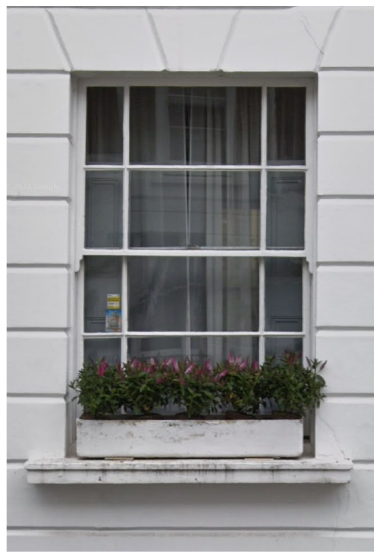
4 EXISTING NEIGHBOURING FRONT WINDOW PHOTO