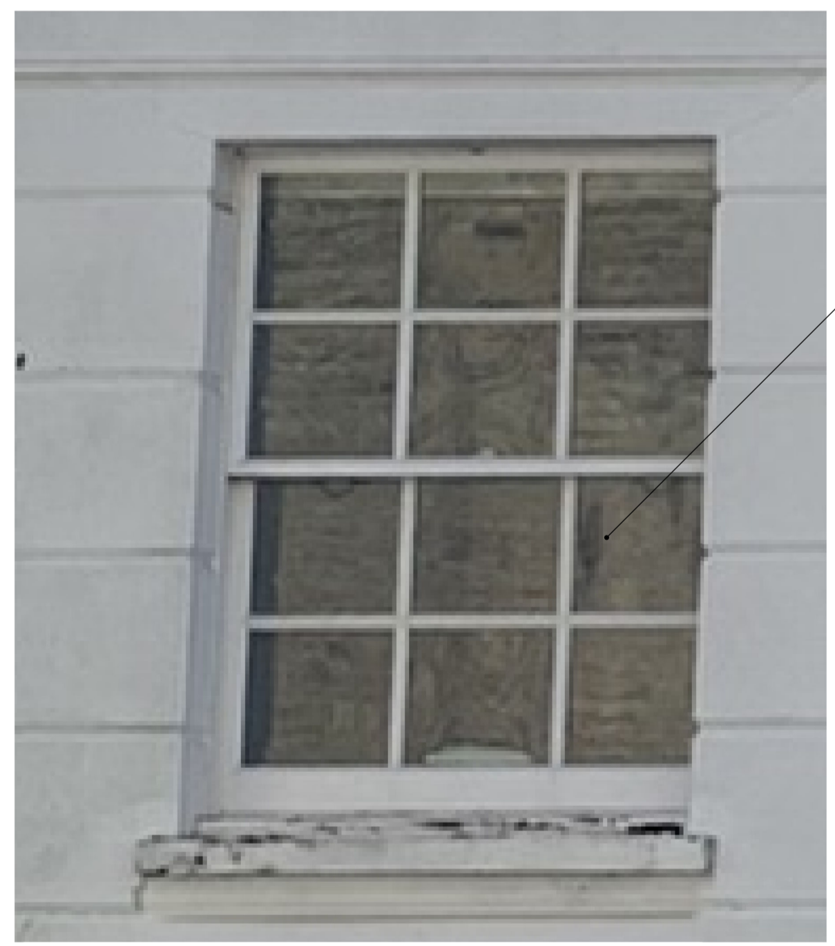
5 EXISTING UPPER GROUND FLOOR FRONT WINDOW PHOTO

THIS DRAWING TO BE READ IN CONJUNCTION WITH THE SPECIFICATION WHERE PROVIDED AND ALL RELEVANT CONSULTANTS DRAWINGS AND/OR SPECIALIST DRAWINGS (DOCUMENTS AND ANY DISCREPANCIES OR VARIATIONS ARE TO BE REPORTED TO THE ARCHITECT BEFORE THE AFFECTED WORK COMMENCES. THIS DRAWING IS PROTECTED BY COPYRIGHT AND MUST NOT BE COPIED OR REPRODUCED WITHOUT THE WRITTEN CONSENT OF CHRIS DYSON ARCHITECTS LLP. NORTH POINTS SHOWN ARE INDICATIVE. ©