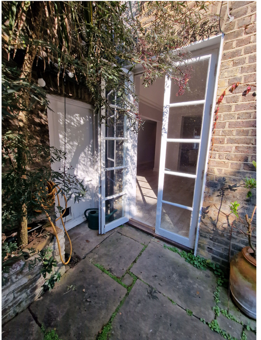
5 EXISTING REAR DOOR PHOTO