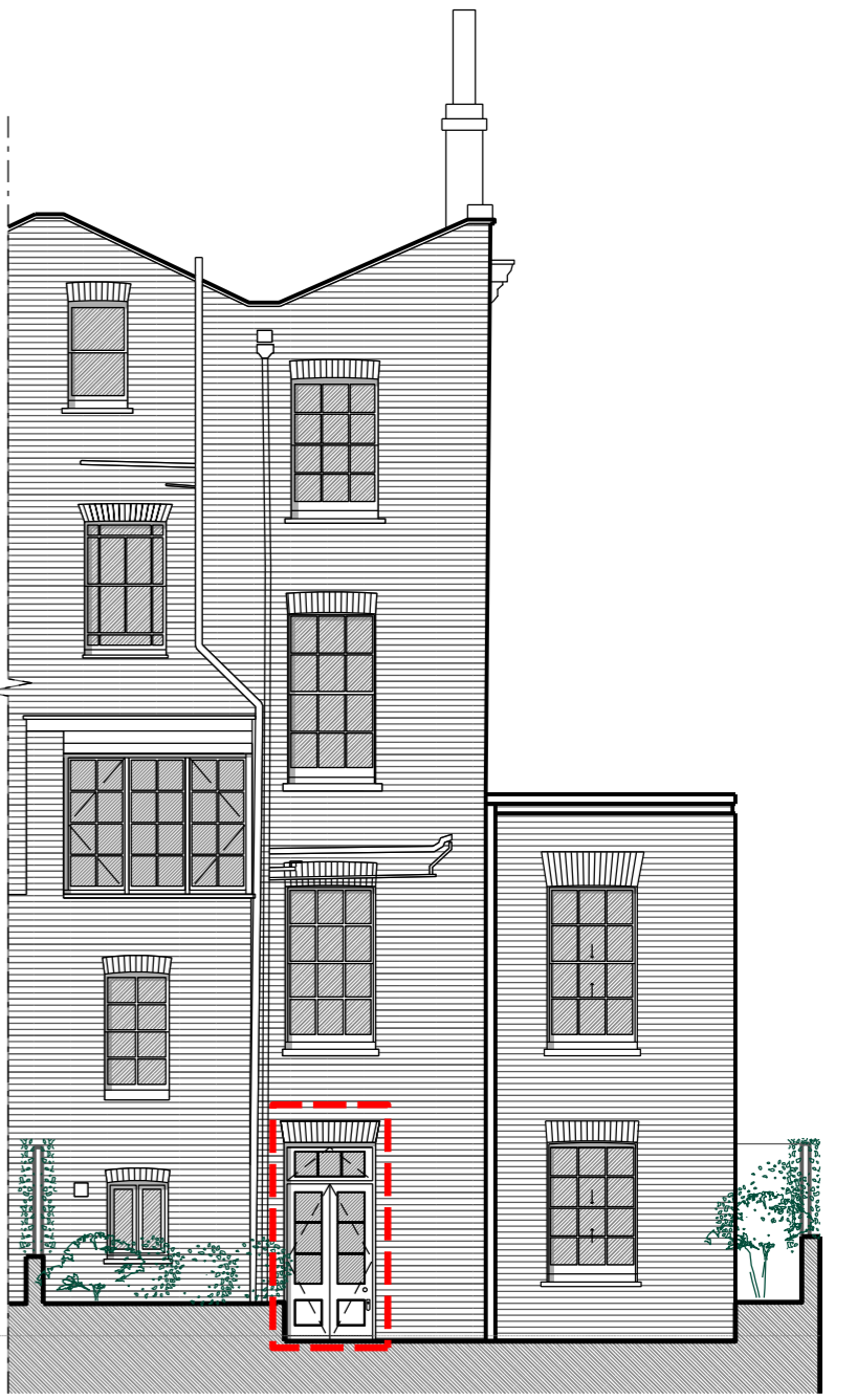
4 1:100 @A1, PROPOSED REAR ELEVATION KEY