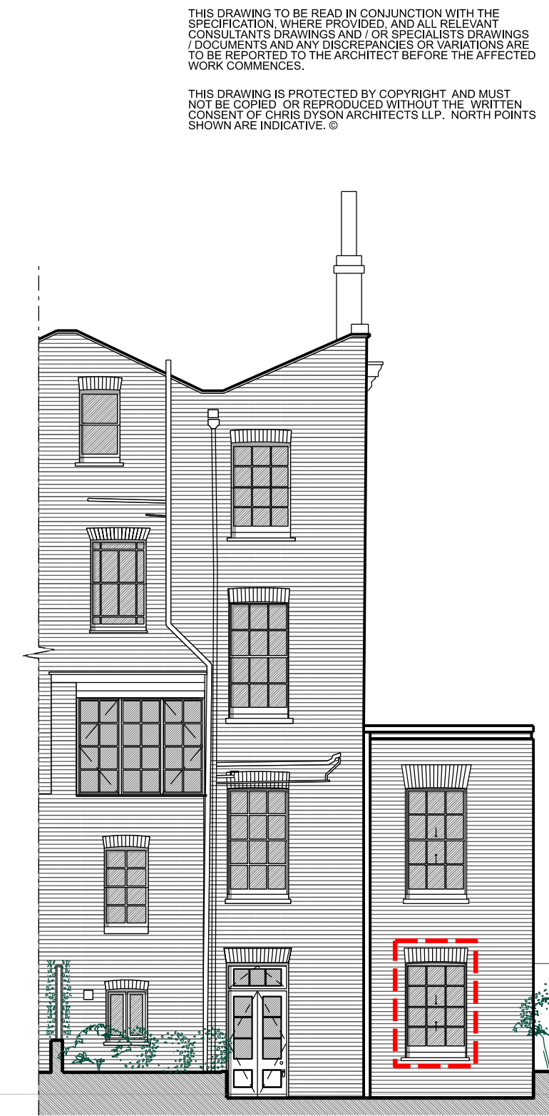
5 1:100 @A1, PROPOSED REAR ELEVATION KEY

PROPOSED REAR BASEMENT TIMBER WINDOWS TO BE PAINTED IN A DARK COLOUR. THE PROPORTIONS AND MOULDING PROFILE WILL MATCH EXISTING.