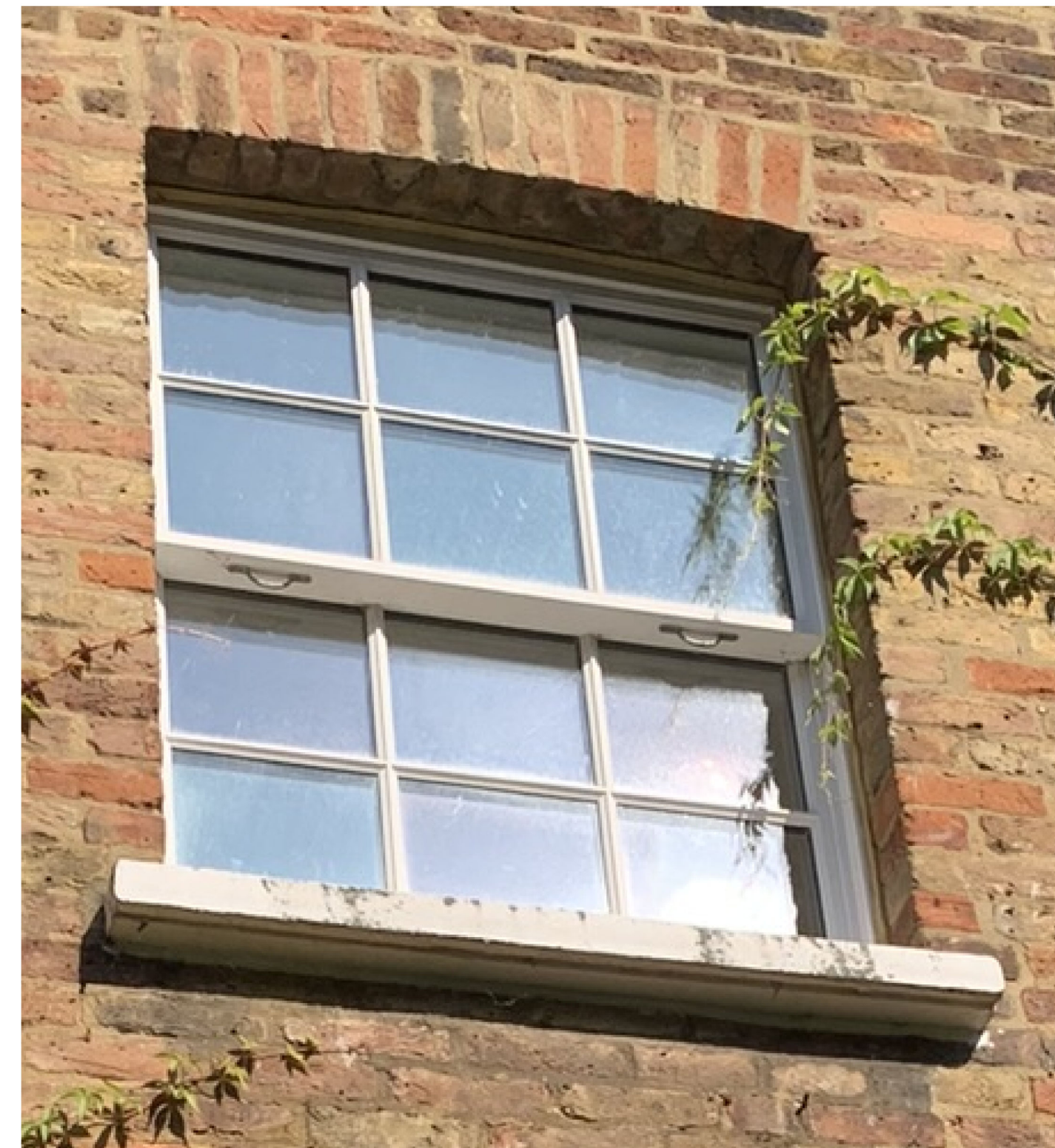
4 EXISTING REAR WINDOW PHOTOS