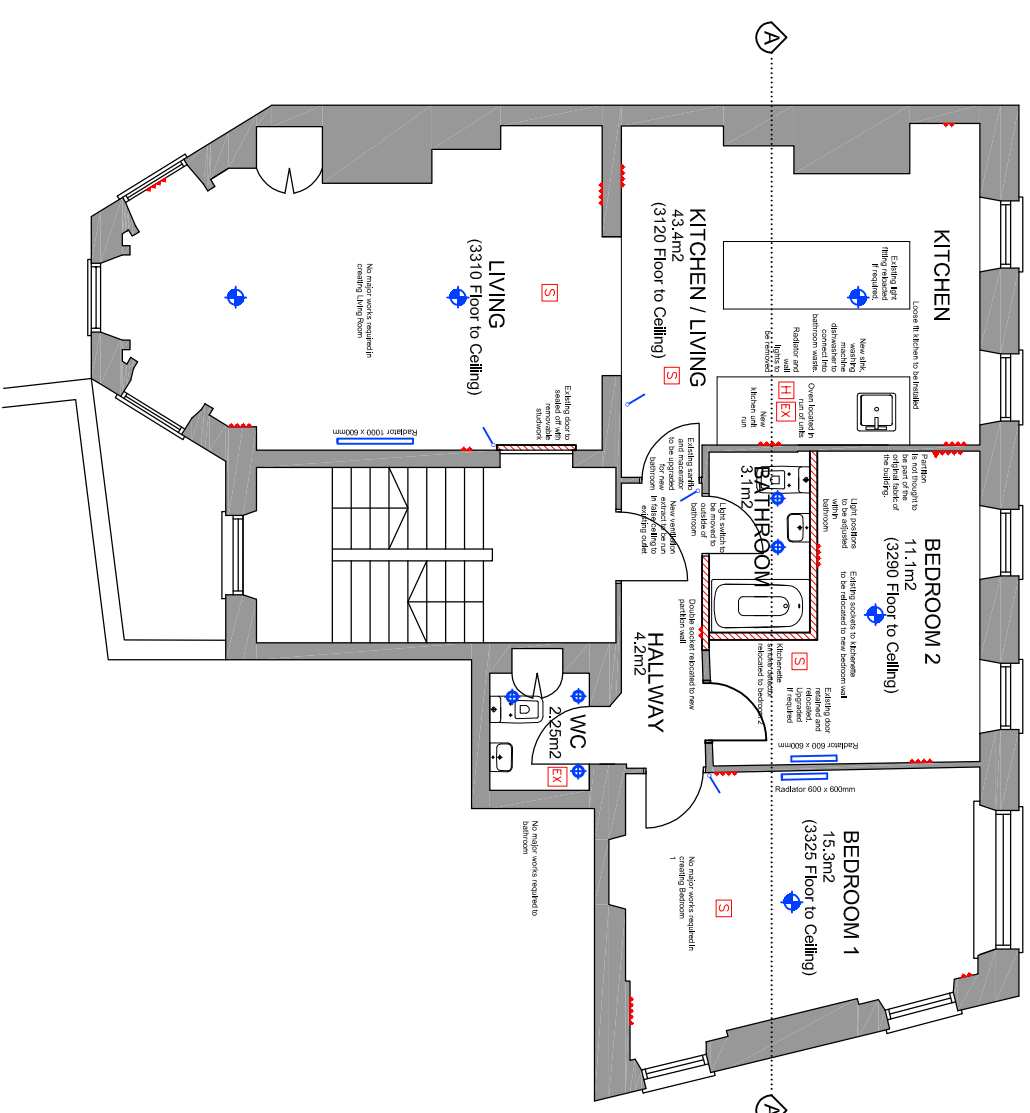
PROPOSED FIRST FLOOR (RESIDENTIAL) PLAN