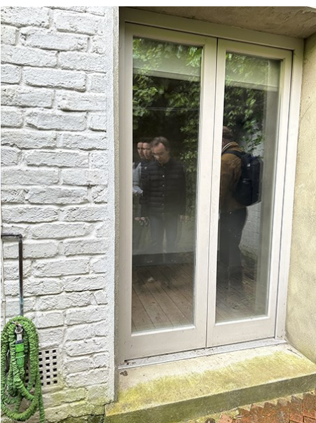
Fig.8 lower ground existing patio doors