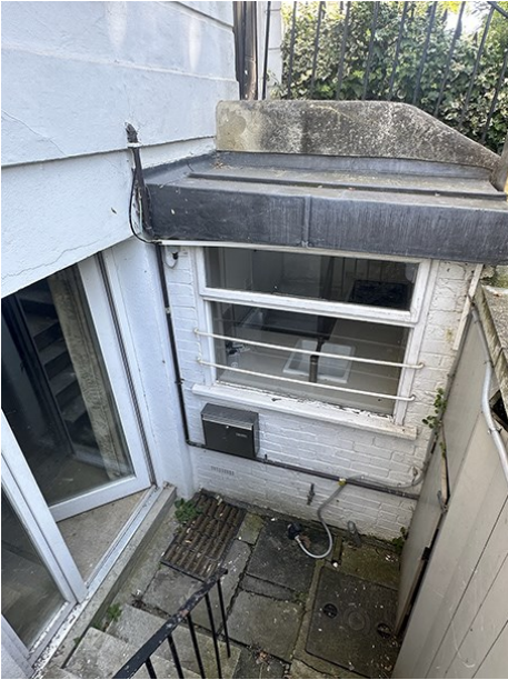
Fig.2 lower ground front lightwell