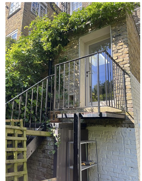
Fig.10 ground floor rear door from outside