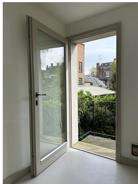
Fig.9 ground floor rear door to garden