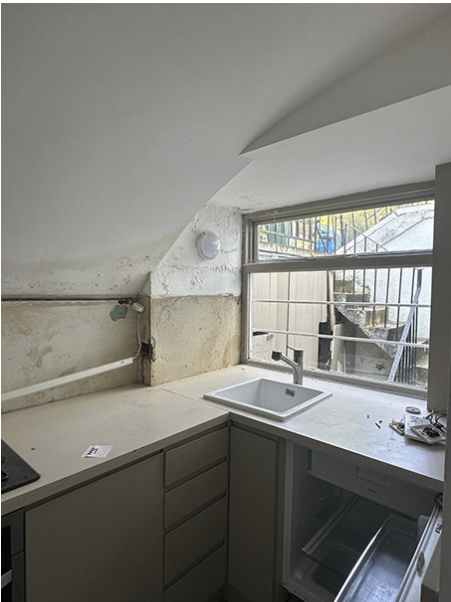
Fig.5 lower ground existing kitchen