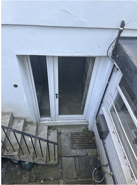
Fig.3 lower ground front existing front door