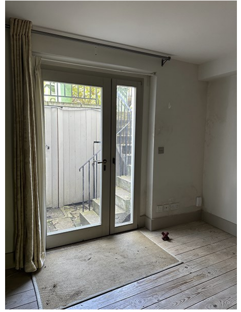
Fig.4 lower ground existing front door from inside