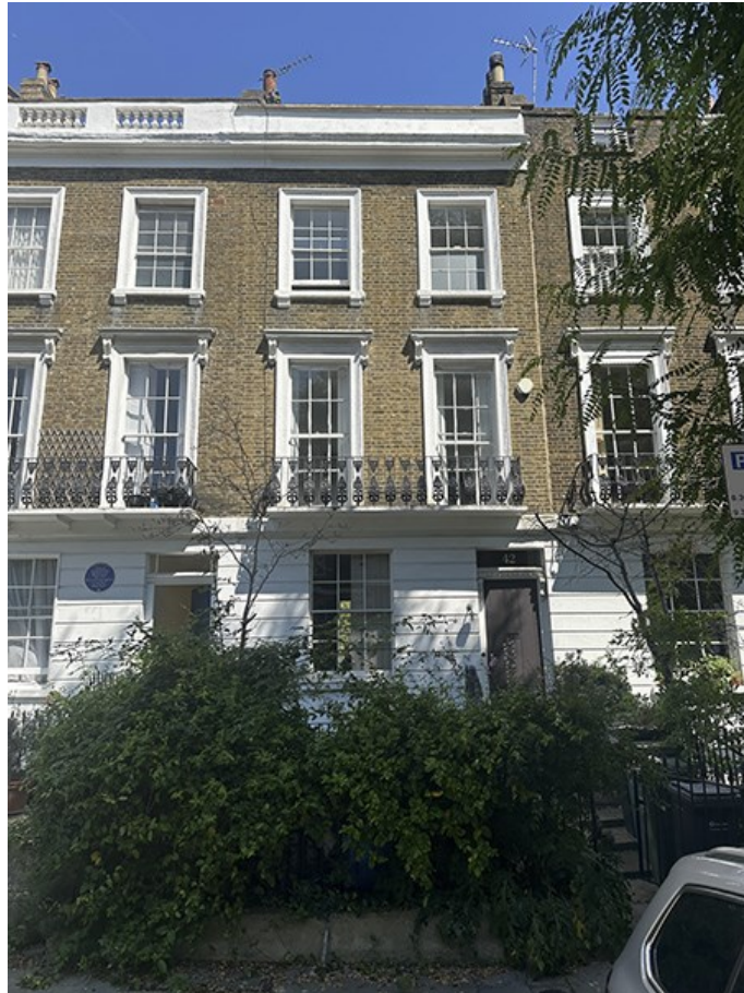
Fig.1 front elevation