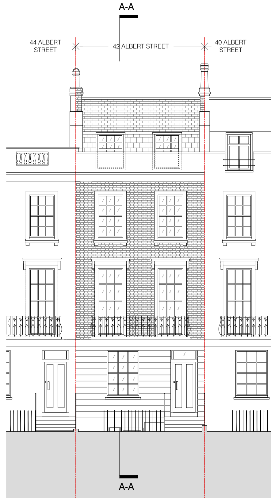
01 EXISTING STREET ELEVATION scale 1:100