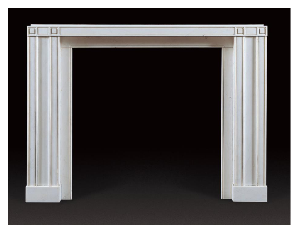
Ground Floor Dining Room