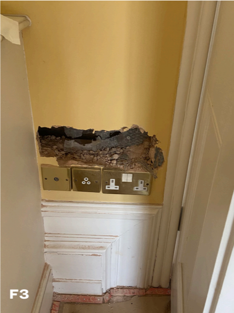
F3 Sitting Room (28) Opening reveals wall is made of timber battens with EML mesh and plaster.