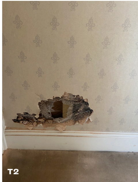
T2 Third Floor Bedroom (41/39) Opening reveals walls are made of timber battens with EML mesh and plaster.