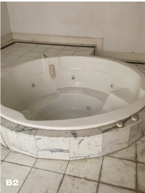
B2 Spa (02) Jacuzzi shows significant existing excavation.