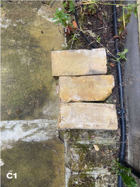
C1 Salvaged Brickwork (Closet Wing Facade) Each age of brick was carefully removed to ensure they can be salvaged and reused within the proposals.