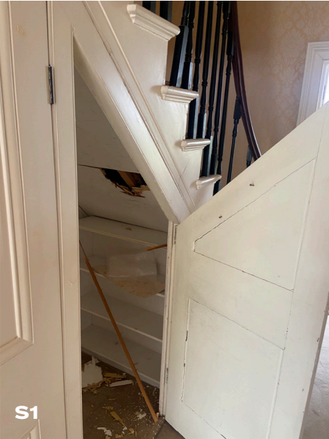
S1 Second Stair (35) Small opening made to the underside of the stair for structural engineer to inspect the structure. Ply boarding and sawn timber battens.

8 Gloucester Gate Photographs taken June 2024