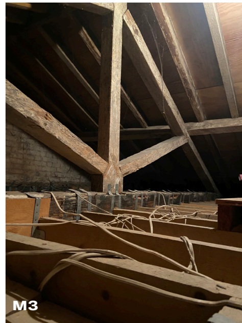
M3 Mews Roof Ply boarding to both sides and sawn timber joists to courtyard side section of mews roof and spanning horizontal sections above ceiling. Plasterboard ceiling on battens fixed below.