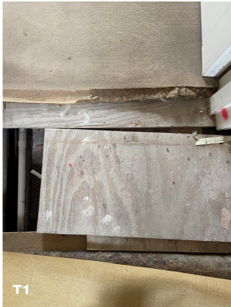
T1 Second Stair (40) Carpeting and underlay were lifted up, showing plywood boarding on joists.