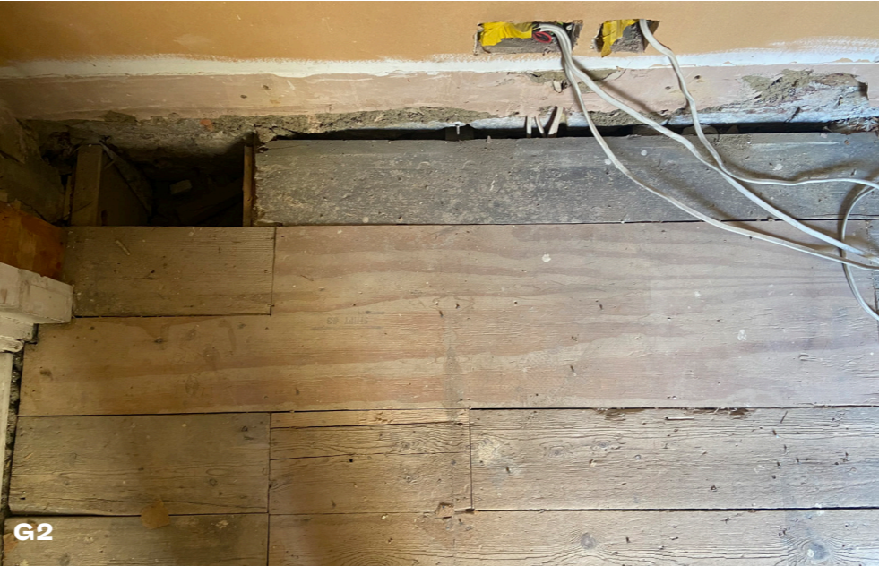
G2 Bar/Library Room (22) Carpeting and underlay were lifted up, showing cut floorboards with modern inserts.