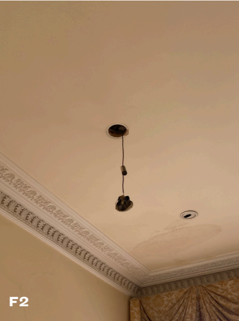
F2 Reception Room (30) Downlight removed to show non original ceiling construction.