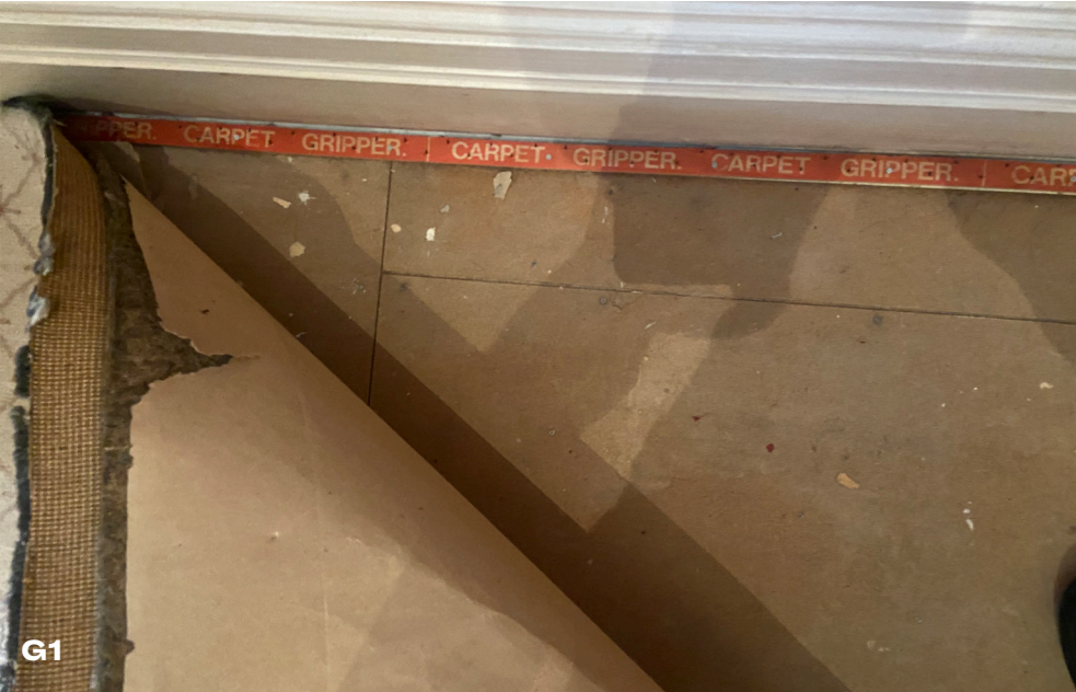
G1 Formal Dining Room (24) Carpeting and underlay were lifted up, showing modern boarding on top of joists.

8 Gloucester Gate Photographs taken June 2024