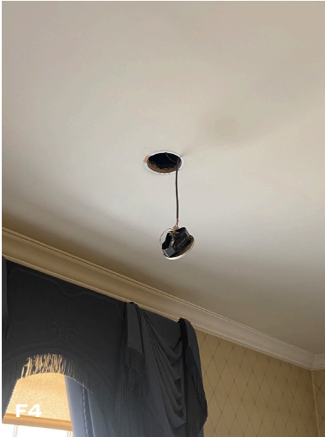
F4 Study (27) Downlight removed to show non original ceiling construction.