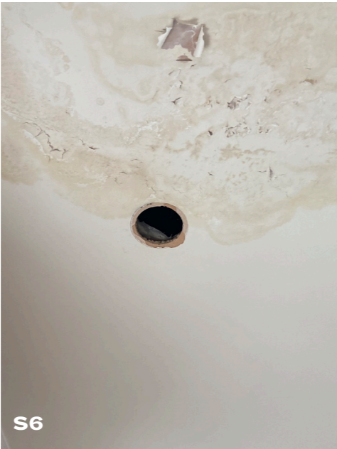
S6 Master Bedroom (34) Downlight removed to show non original ceiling construction.