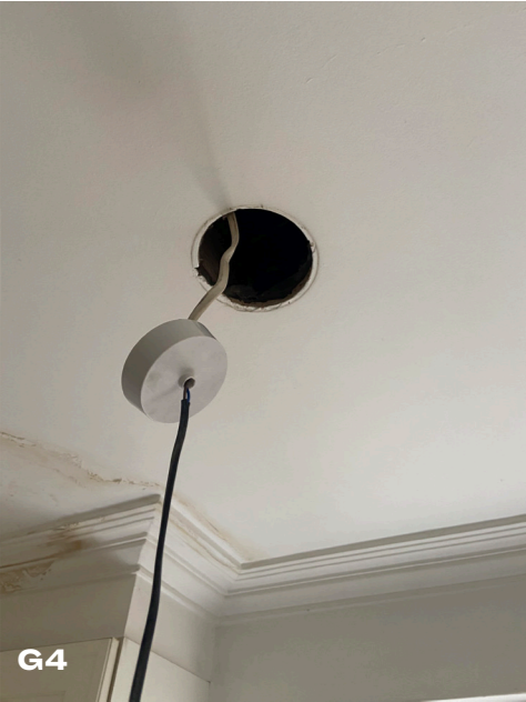
G4 Kitchen (21) Downlight removed to show non original ceiling construction.