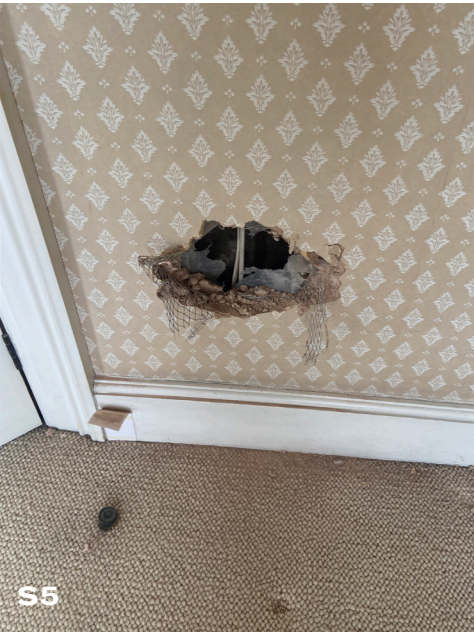
S5 Master Bedroom (34) Opening reveals wall is made of timber battens with EML mesh and plaster.