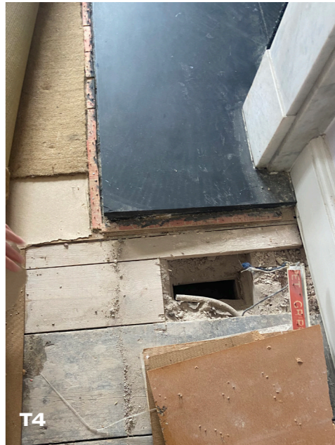
T4 Third Floor Bedroom (39) Carpeting and underlay were lifted up, showing cut floorboards and modern inserts.