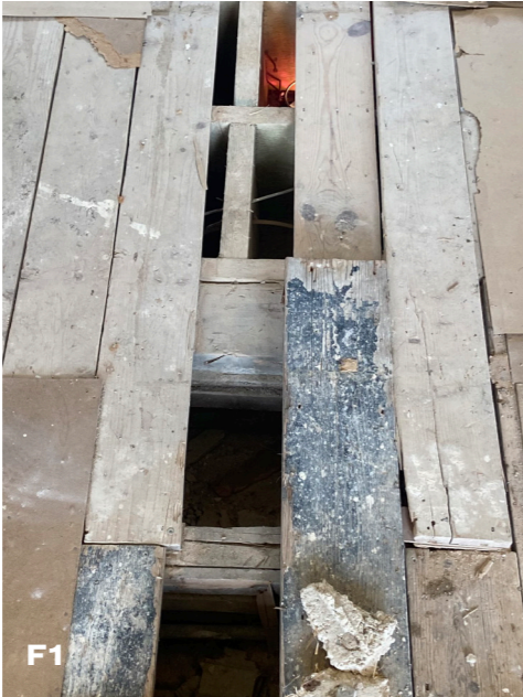
F1 Reception Room (30) Carpeting and underlay were lifted up, majority newer floorboards with sections of larger boarding