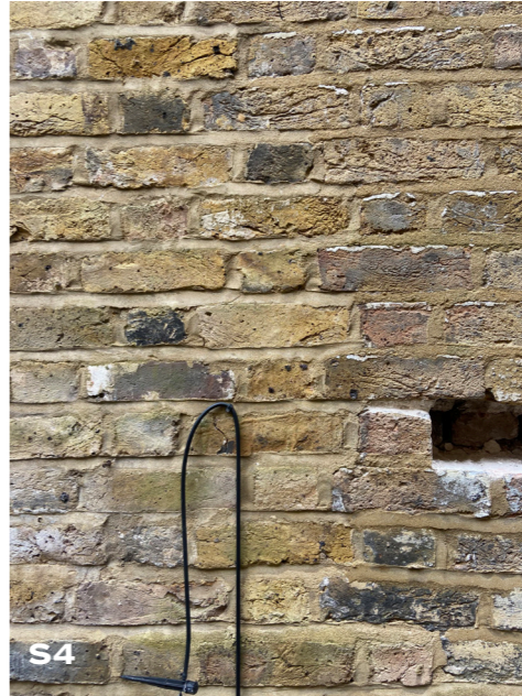
S4 Brickwork (Mews Facade) Modern infill to the arches