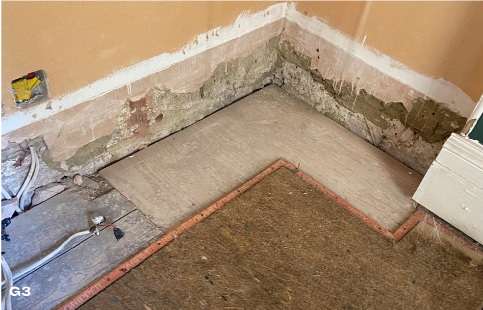
G3 Bar/Library Room (22) Carpeting and underlay were lifted up, showing cut floorboards with large sections of plywood boarding