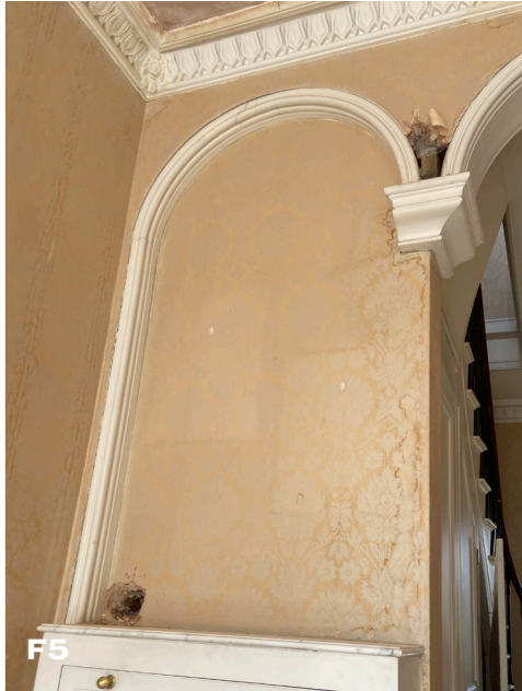
F5 Main Stair (29) Small openings made in the archway at the top of the main stair indicating the wall is timber study on EML mesh and plaster.