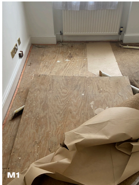
M1 Mews Bedroom (16) Carpeting and underlay were lifted up, showing plywood boarding on joists.