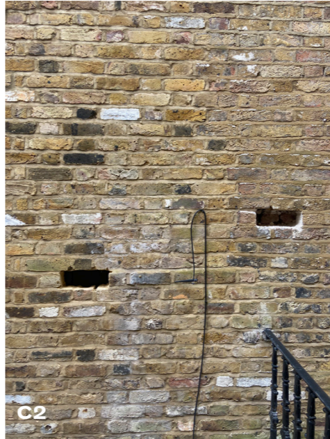
C2 Brickwork (Closet Wing Facade) Transition of two brick ages.