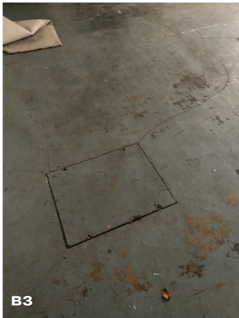
B3 Garage (01) Concrete slab with paint finish