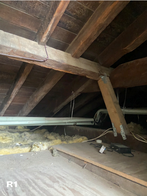
R1 Roof space (Above 41/39) Plyboarding with insulation laid on top of roof joists. Sawn timber support brace.

8 Gloucester Gate Photographs taken June 2024