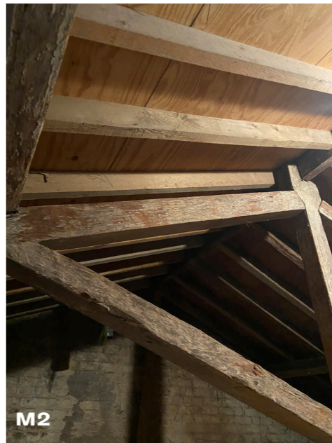
M2 Mews Roof Ply boarding to both sides and sawn timber joists to courtyard side section of mews roof and spanning horizontal sections above ceiling. Plasterboard ceiling on battens fixed below.