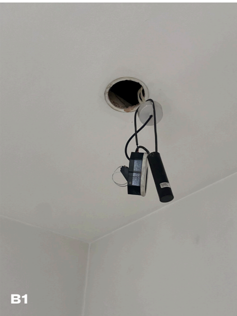
B1 Spa (02) Downlight removed to show non original ceiling construction.