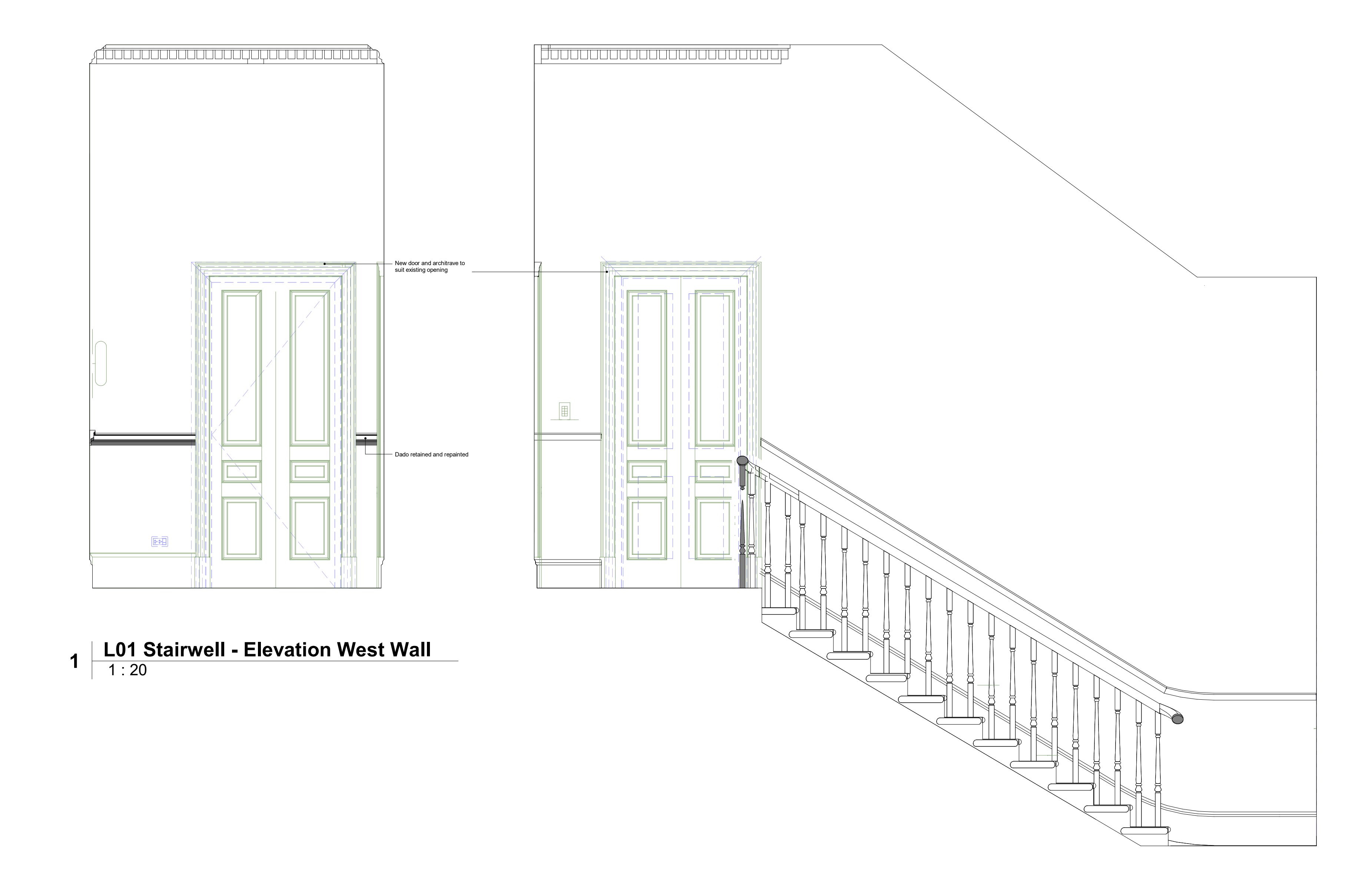
2 L01 Stairwell - Elevation North Wall