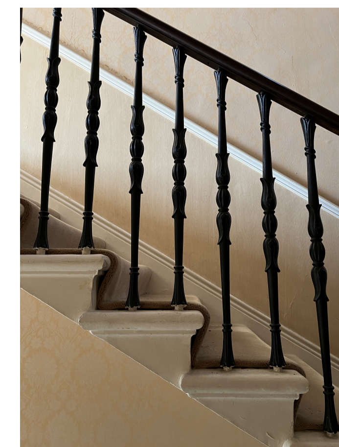
Existing stair condition

Dowen Farmer Architects Ltd is incorporated in England & Wales. Company registration number 10861309.