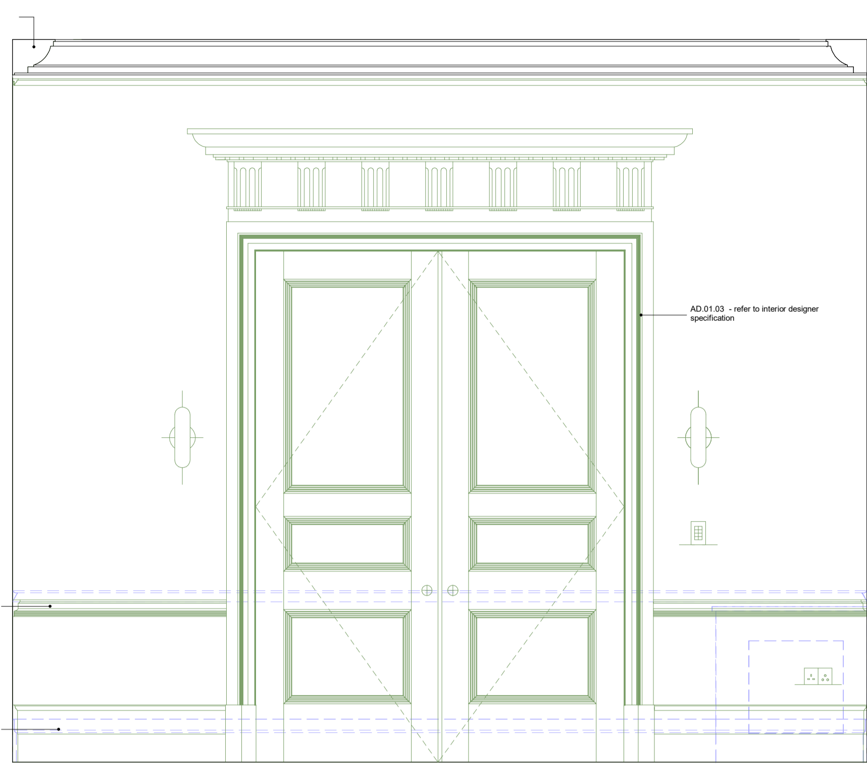
2 | L00 Dining - Elevation East Wall 1 : 20