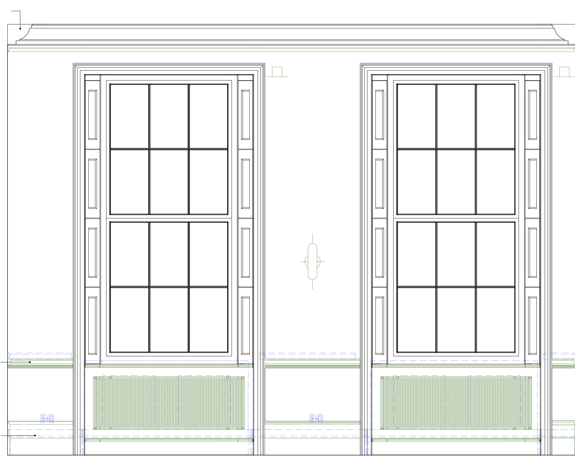
4 | L00 Dining - Elevation West Wall 1 : 20