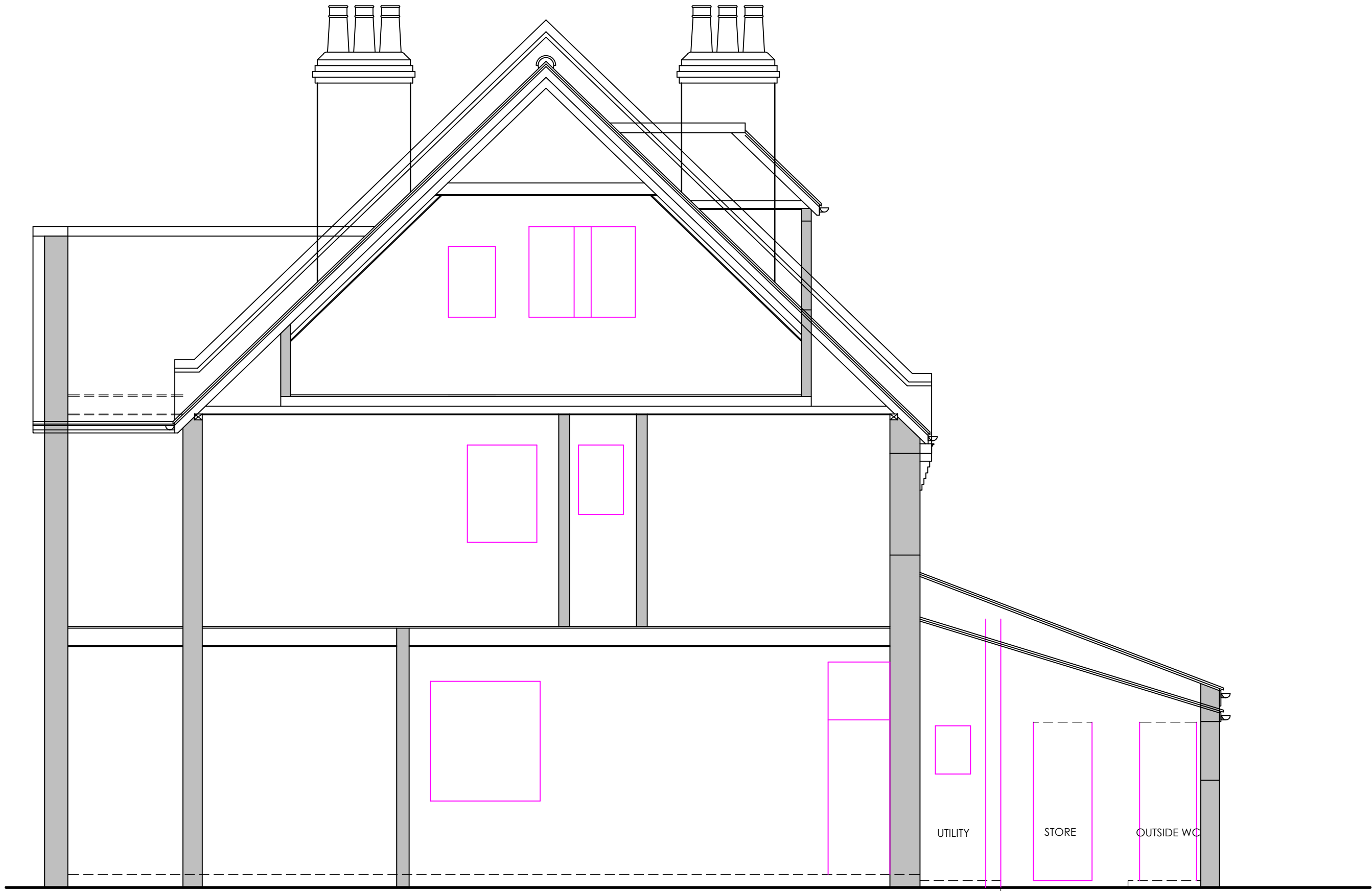
EXISTING SECTION 1:50