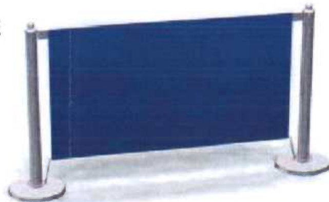
BARRIER STYLE (Colour Black)