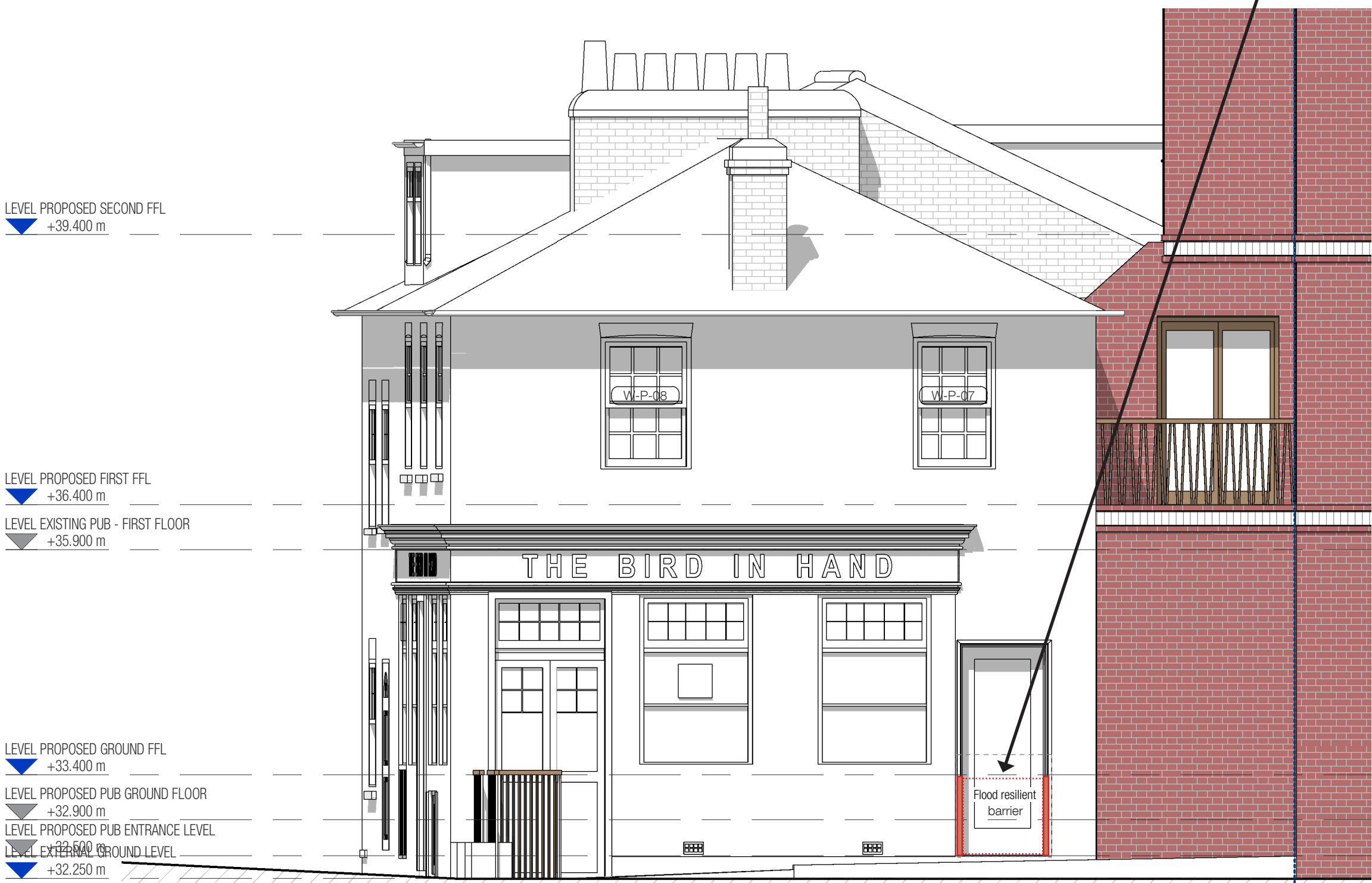
PROPOSED NORTH-EAST ELEVATION