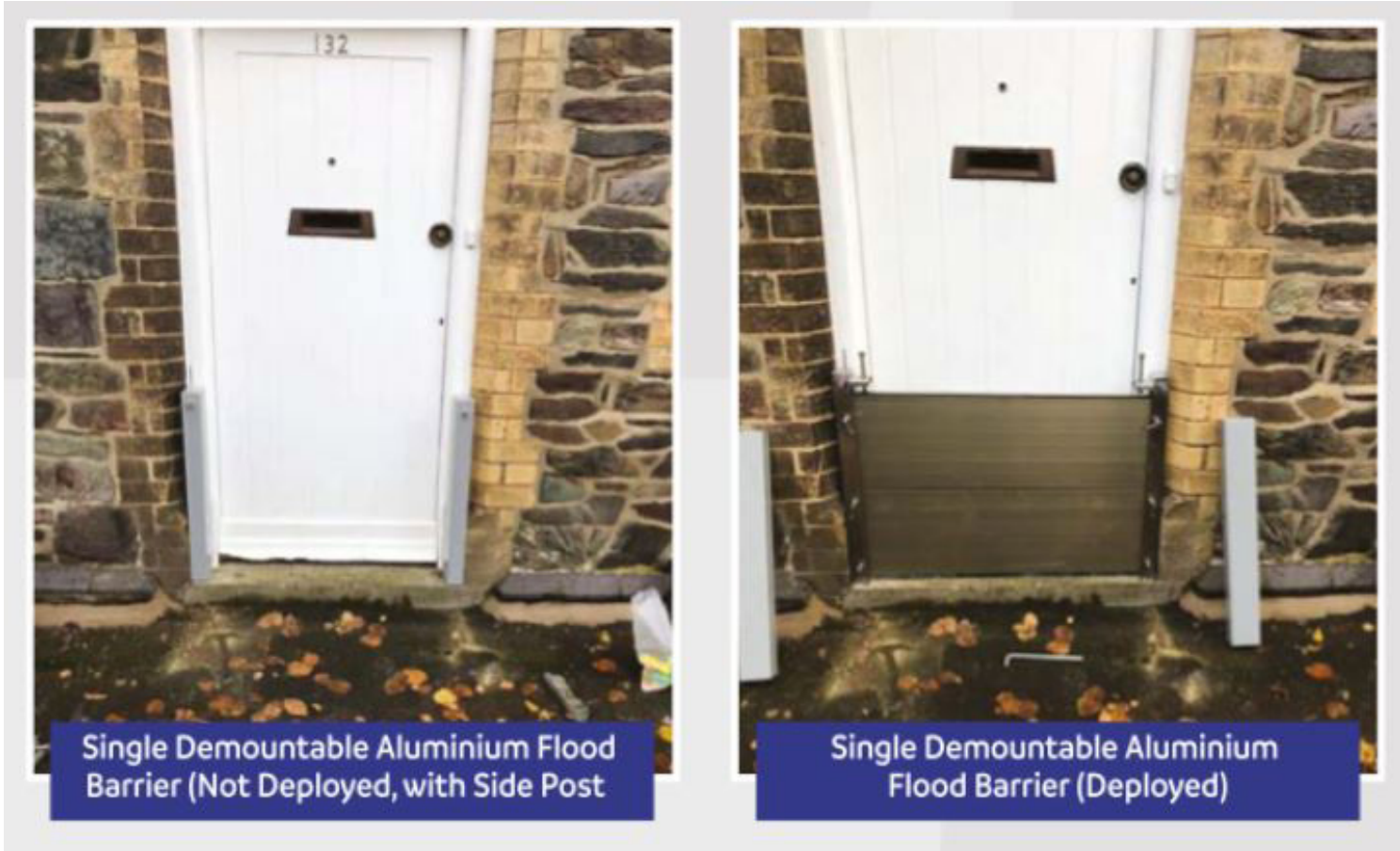
Example of demountable flood barrier with side posts

THIS DRAWING IS ISSUED FOR COORDINATION ONLY. NOT FOR CONSTRUCTION. ALL INFORMATION SHOWN IS SUBJECT TO PLANNING APPROVAL, COORDINATION WITH ENGINEERS AND M&E CONSULTANT AND DETAILED DESIGN DEVELOPMENT.