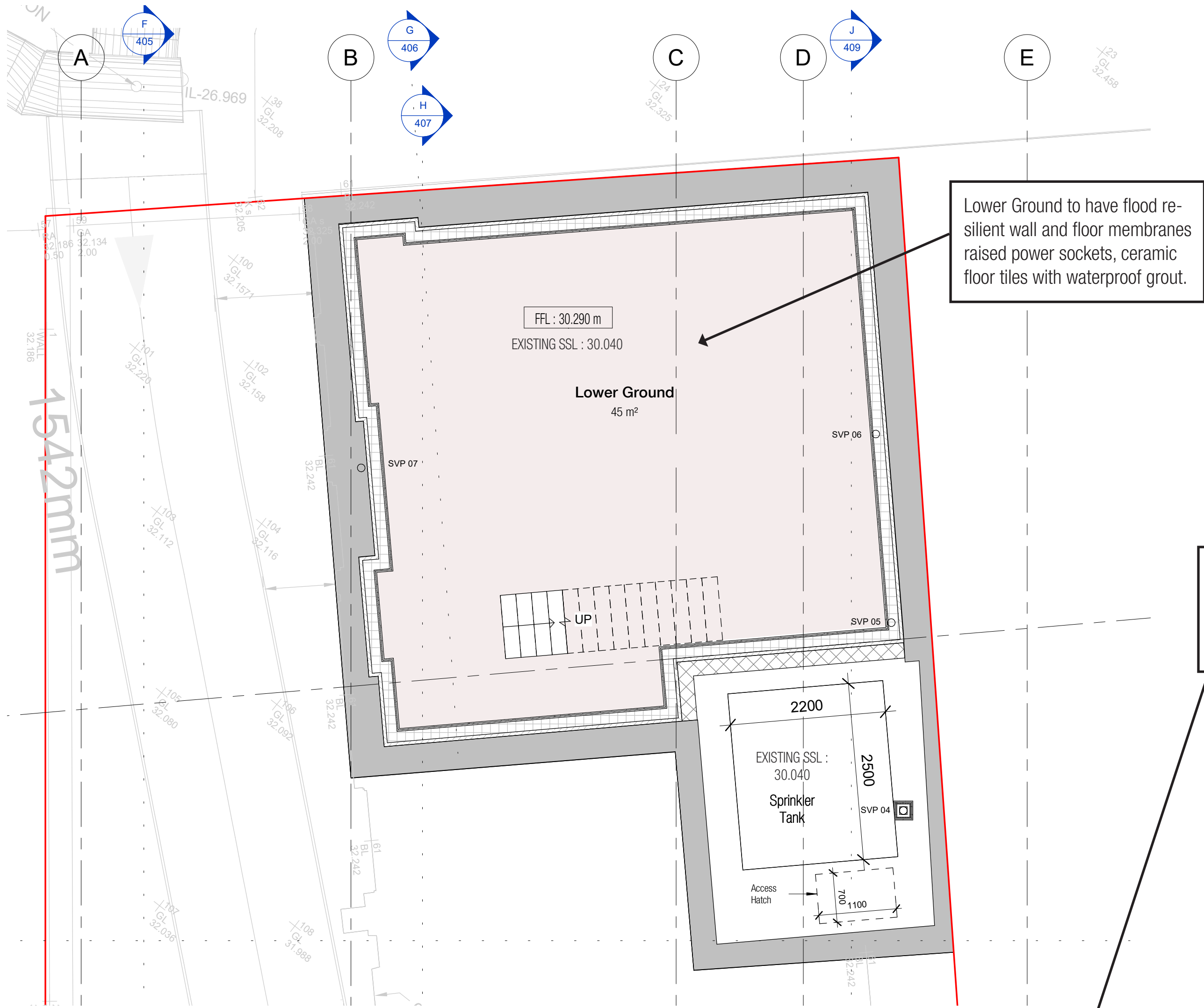
PROPOSED BASED FLOOR PLAN