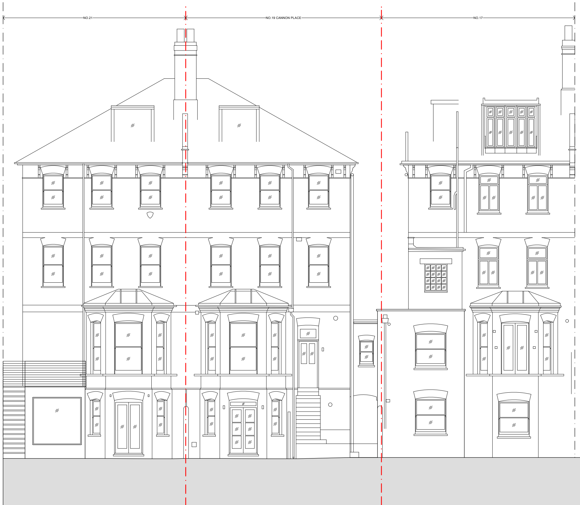
1 Existing Rear Elevation Scale: 1:100