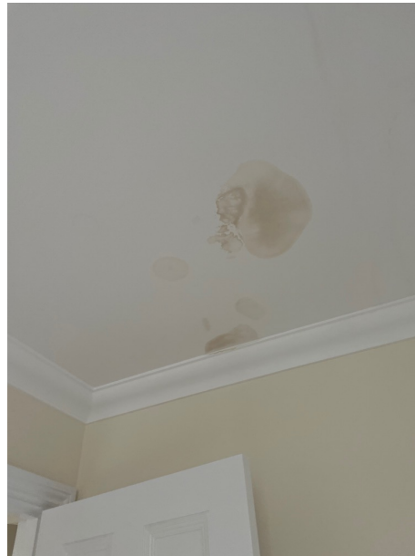
Fig.6. Internal View.