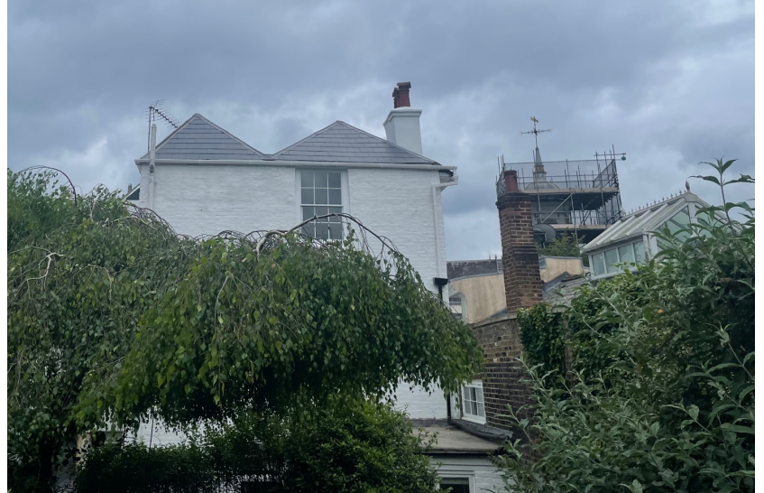
Fig.4. External Rear view.