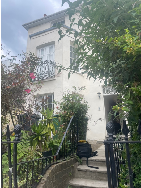
Fig.3. External front view .