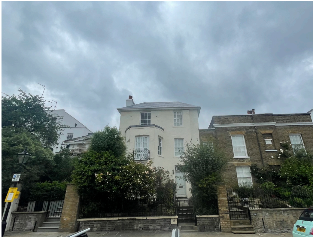
Fig.1: Front elevation of 15 Downshire Hill