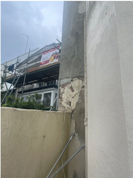
Fig.5. External view of the existing walls.