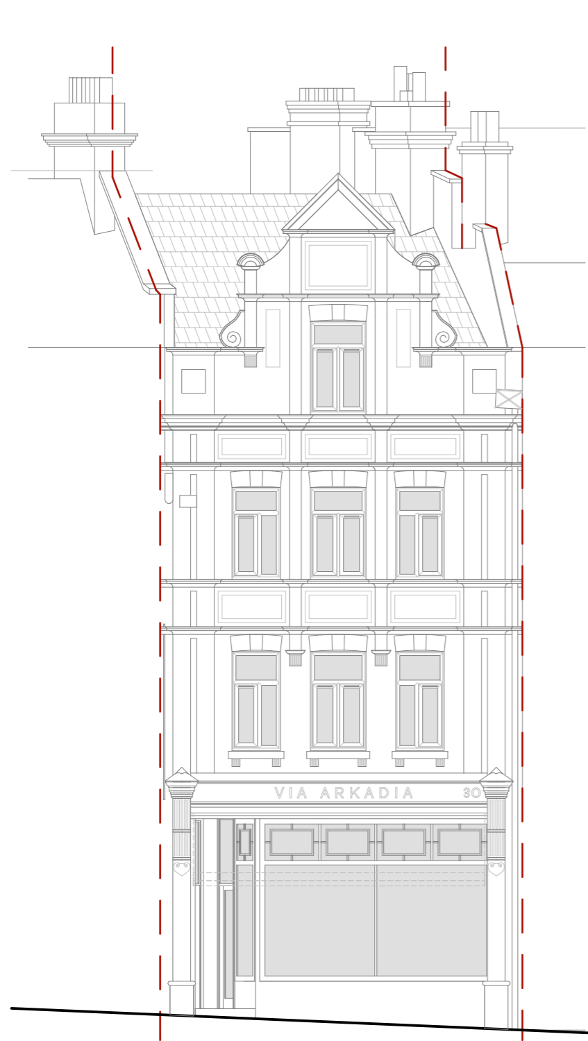
Existing Front Elevation, Scale 1:100

New conservation rooflight (3 pane) New conservation rooflight (2 pane)