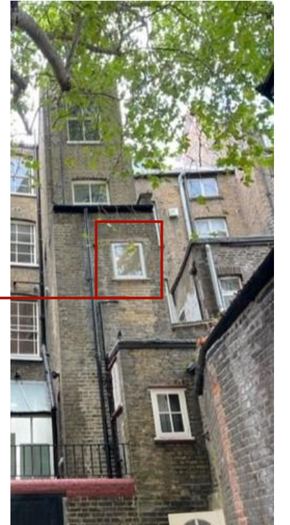
Existing white uPVC casement window with trickle vent