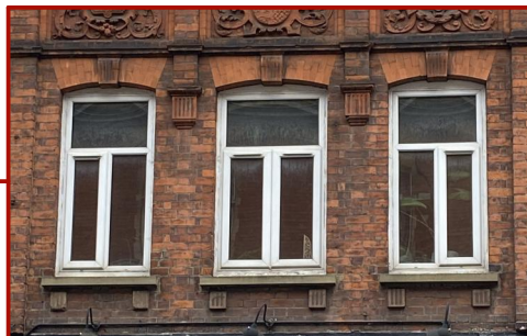
Existing white uPVC casement windows with fixed transom panes and trickle vents