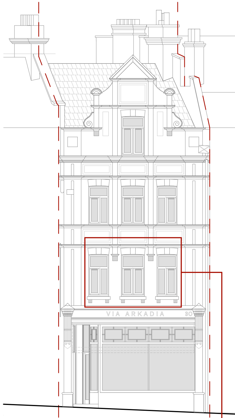
Existing Front Elevation, Scale 1:100