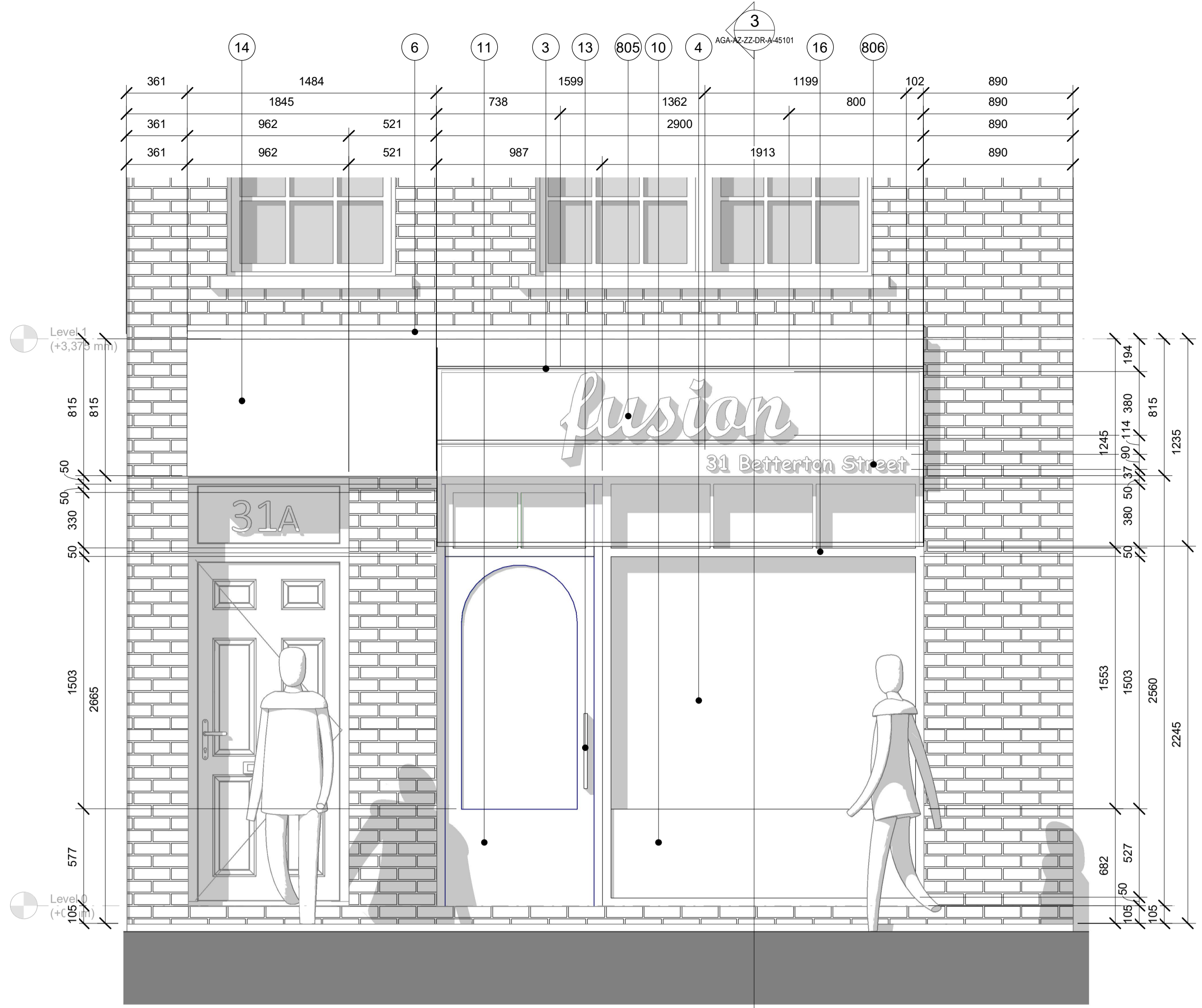
2 45201-North Elevation Proposed SCALE: 1 : 20

RJ Ref Scale (A1) Status Revision 1093 As indicated Planning P01 Drawing Number 1093-AGA-AGA-AZ-ZZ-DR-A-45101