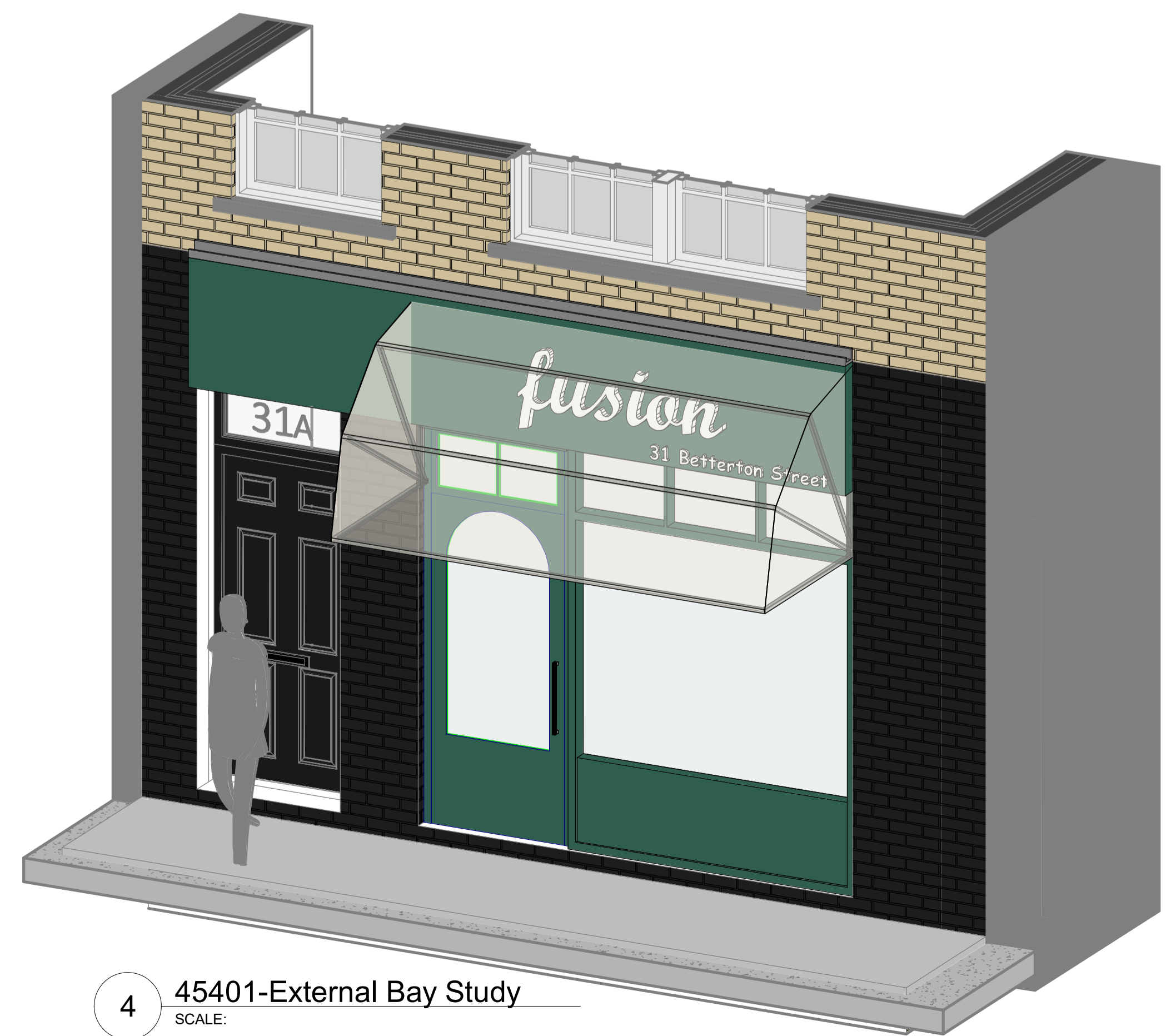
4 45401-External Bay Study SCALE: