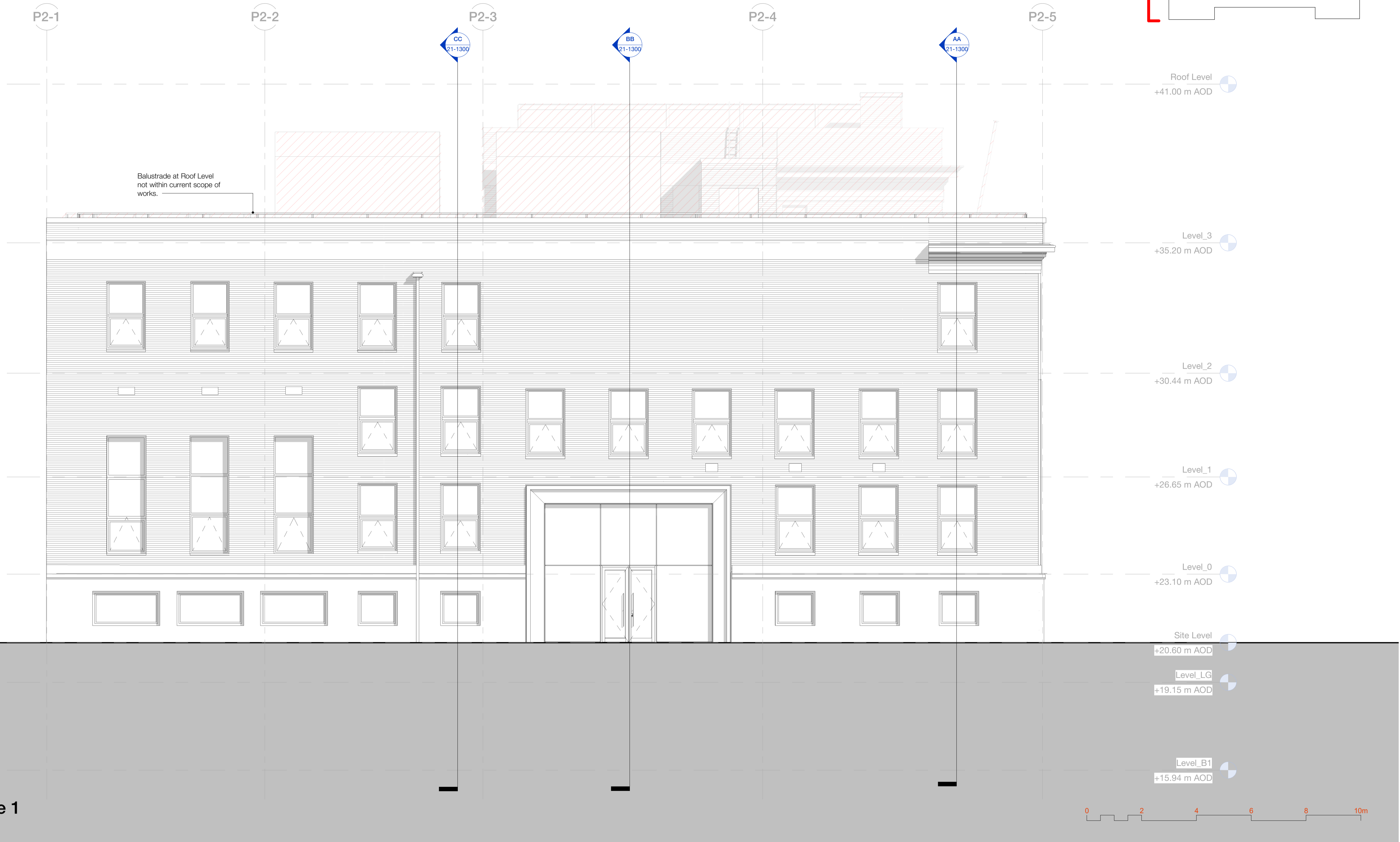
North Elevation - Proposed Phase 1 1 : 75