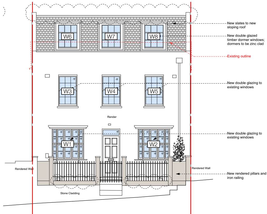
1 KEY FRONT ELEVATION Scale: 1:100