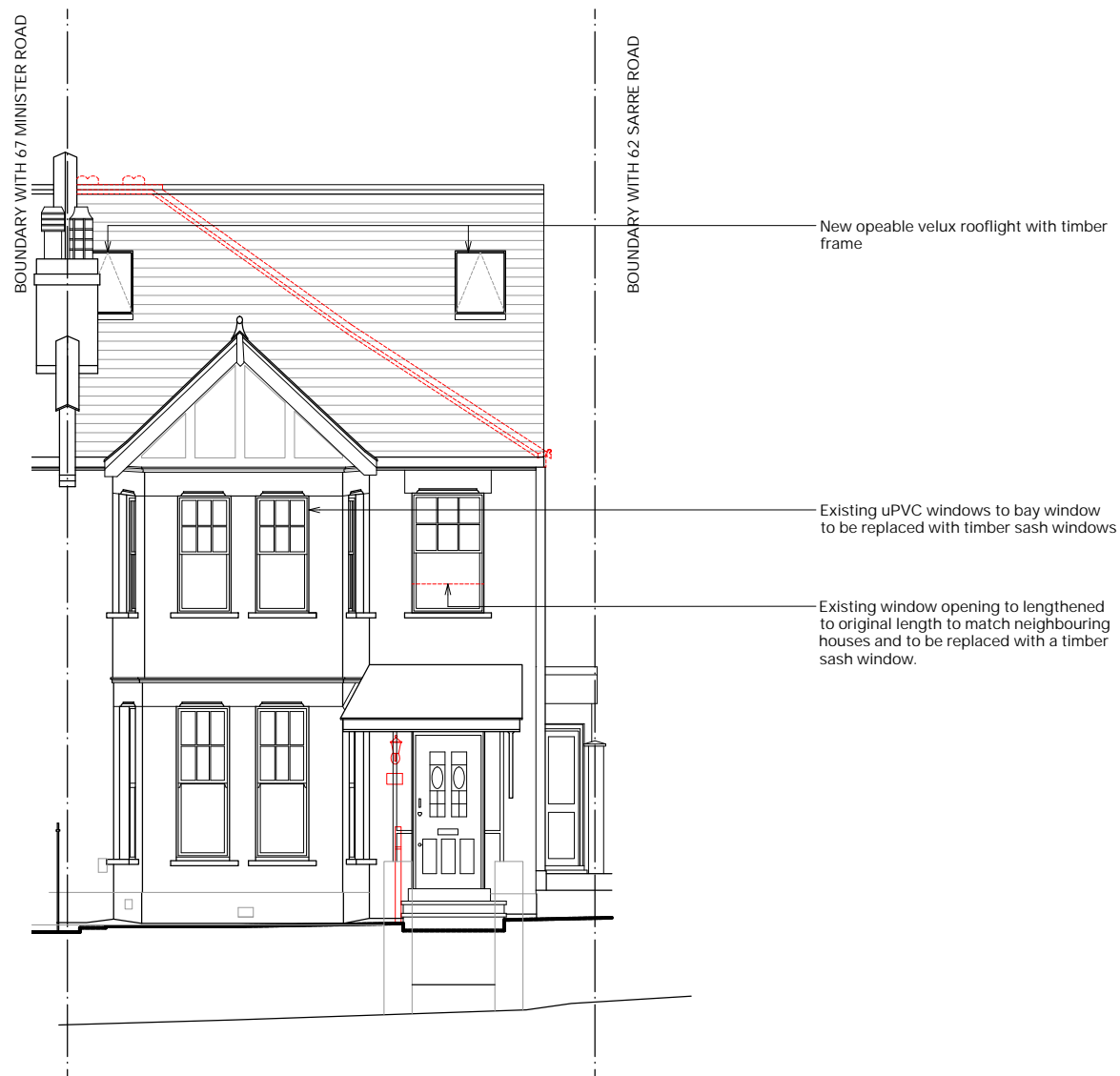
1 Proposed front elevation