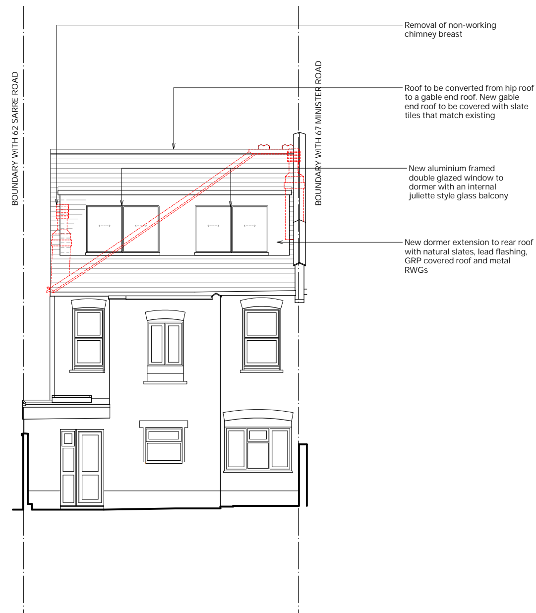
2 Proposed rear extension