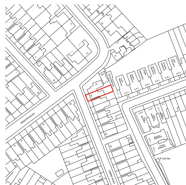
1 Site Location Plan scale 1:1250