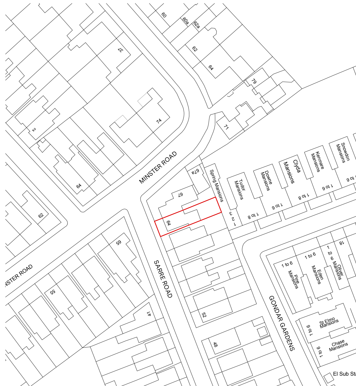
2 Site Block Plan scale 1:500