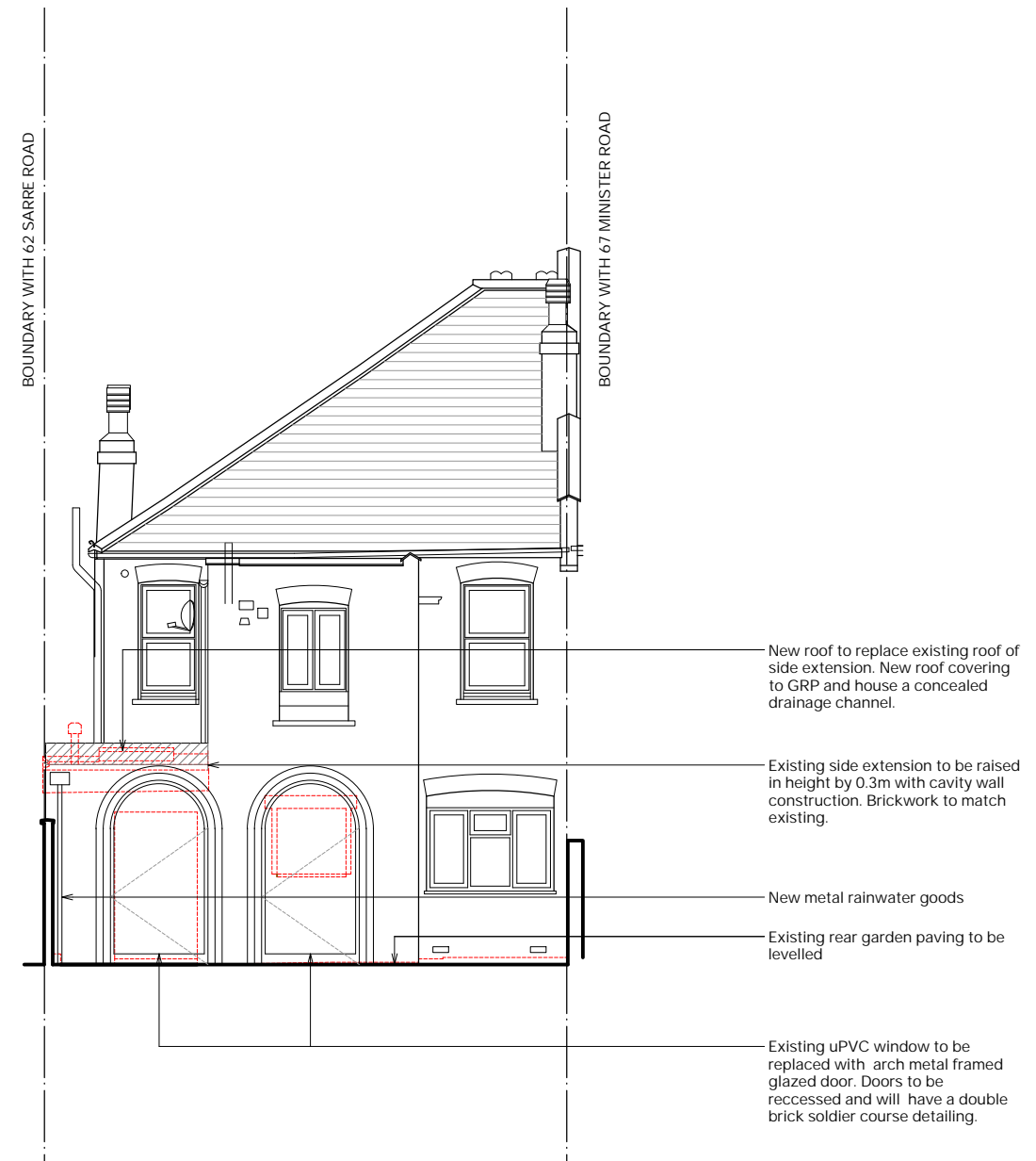
2 Proposed rear extension