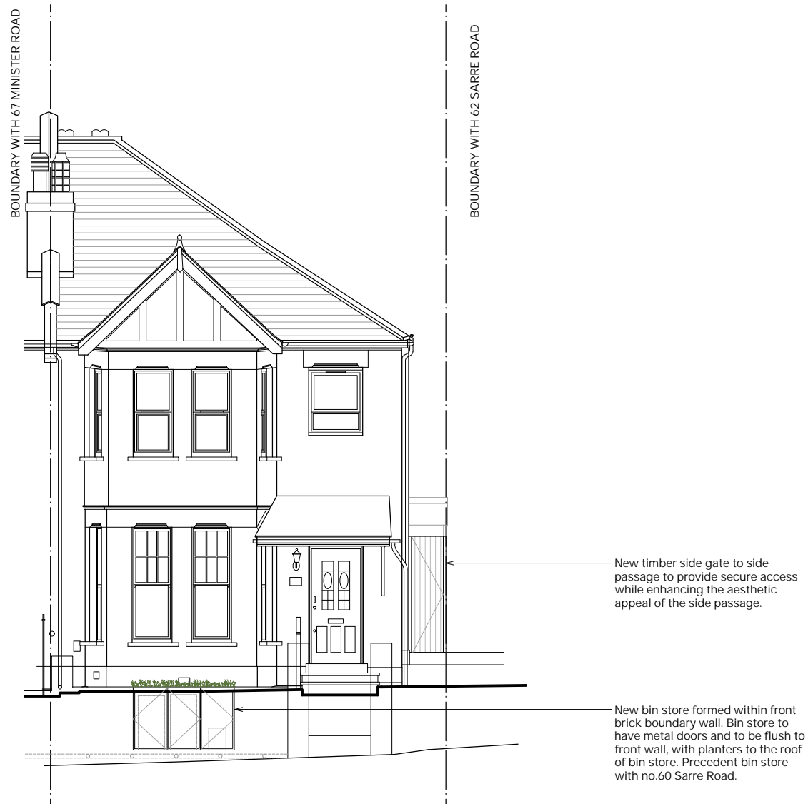
1 Proposed front elevation