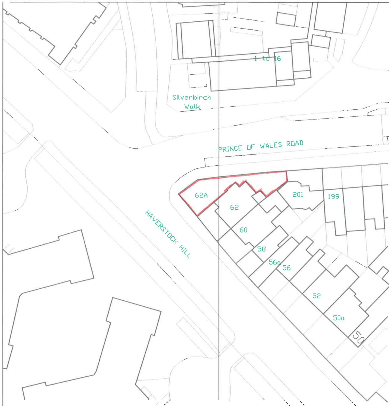
1:500 BLOCK PLAN