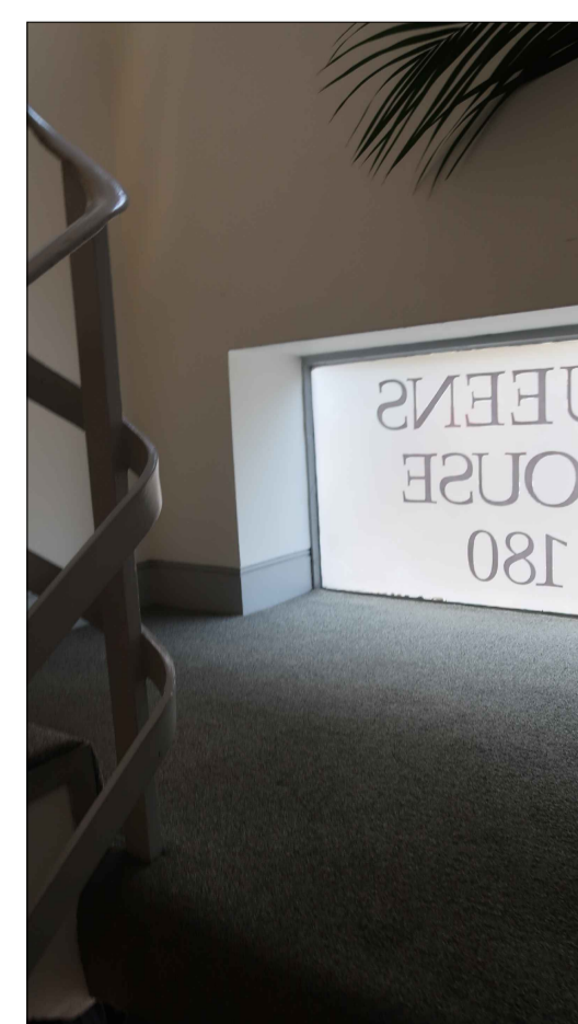
[08] Internal view of half landing and external window