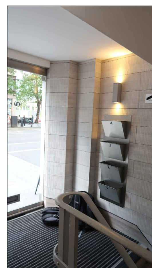
[07] Internal view of front entrance lobby