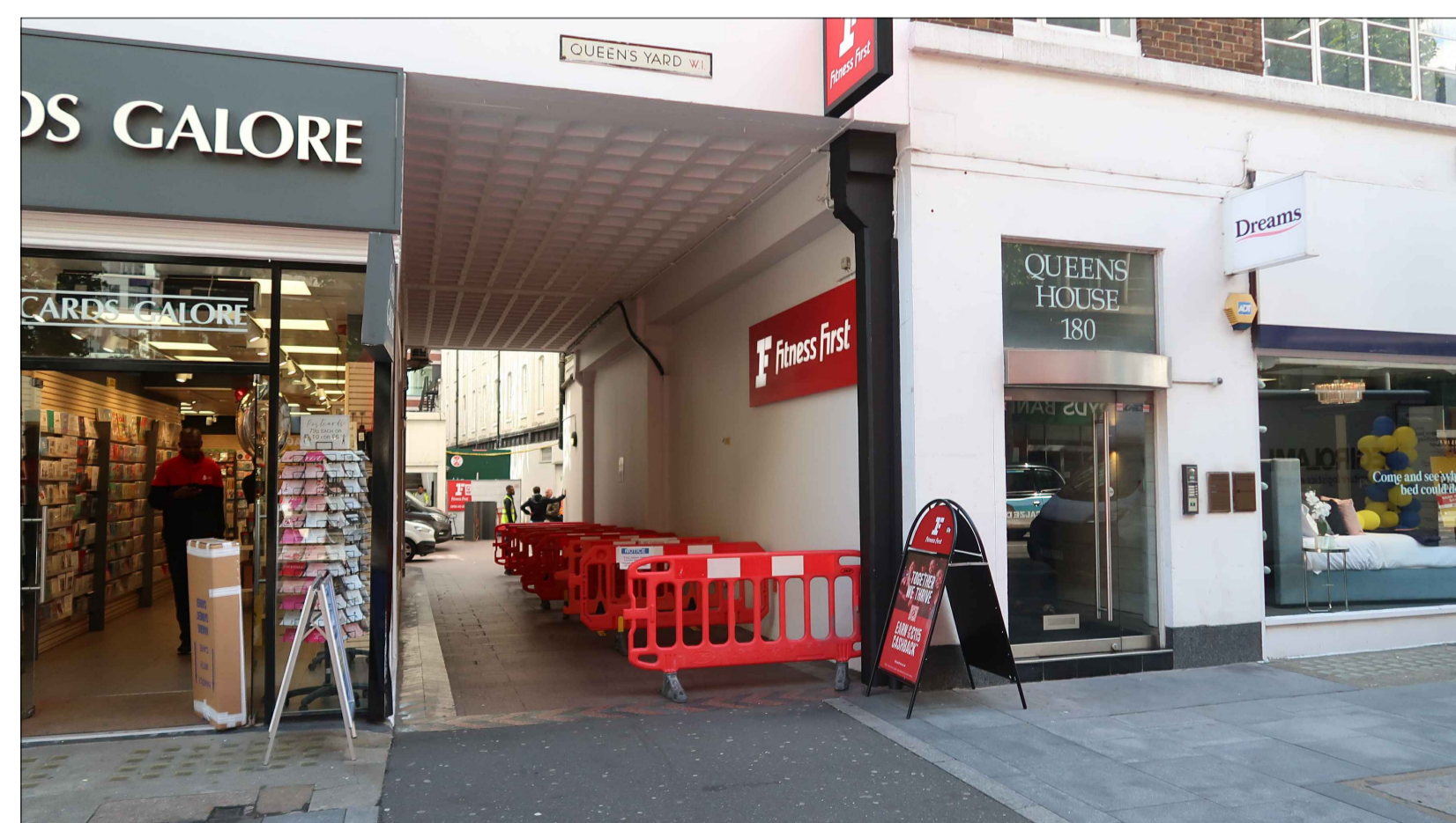
[09] Streetscene view of undercroft leading to Queen's Yard

NOTE: DO NOT SCALE FROM DRAWINGS - EXCEPT FOR PLANNING PURPOSES. ALL DISCREPANCIES TO BE REPORTED TO ARCHITECT IMMEDIATELY. ALL DIMENSIONS TO BE VERIFIED BY CONTRACTOR ON SITE PRIOR TO THE COMMENCEMENT OF ANY WORKS.