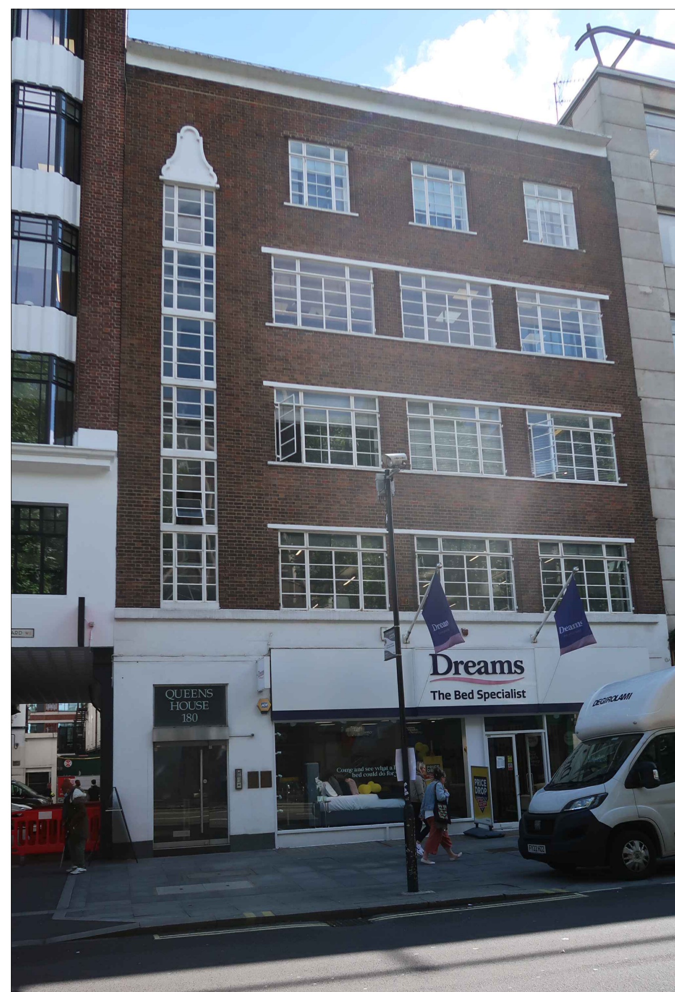
[03] Streetscene view of front facade