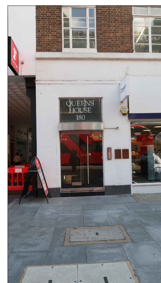
[04] Streetscene view of front entrance