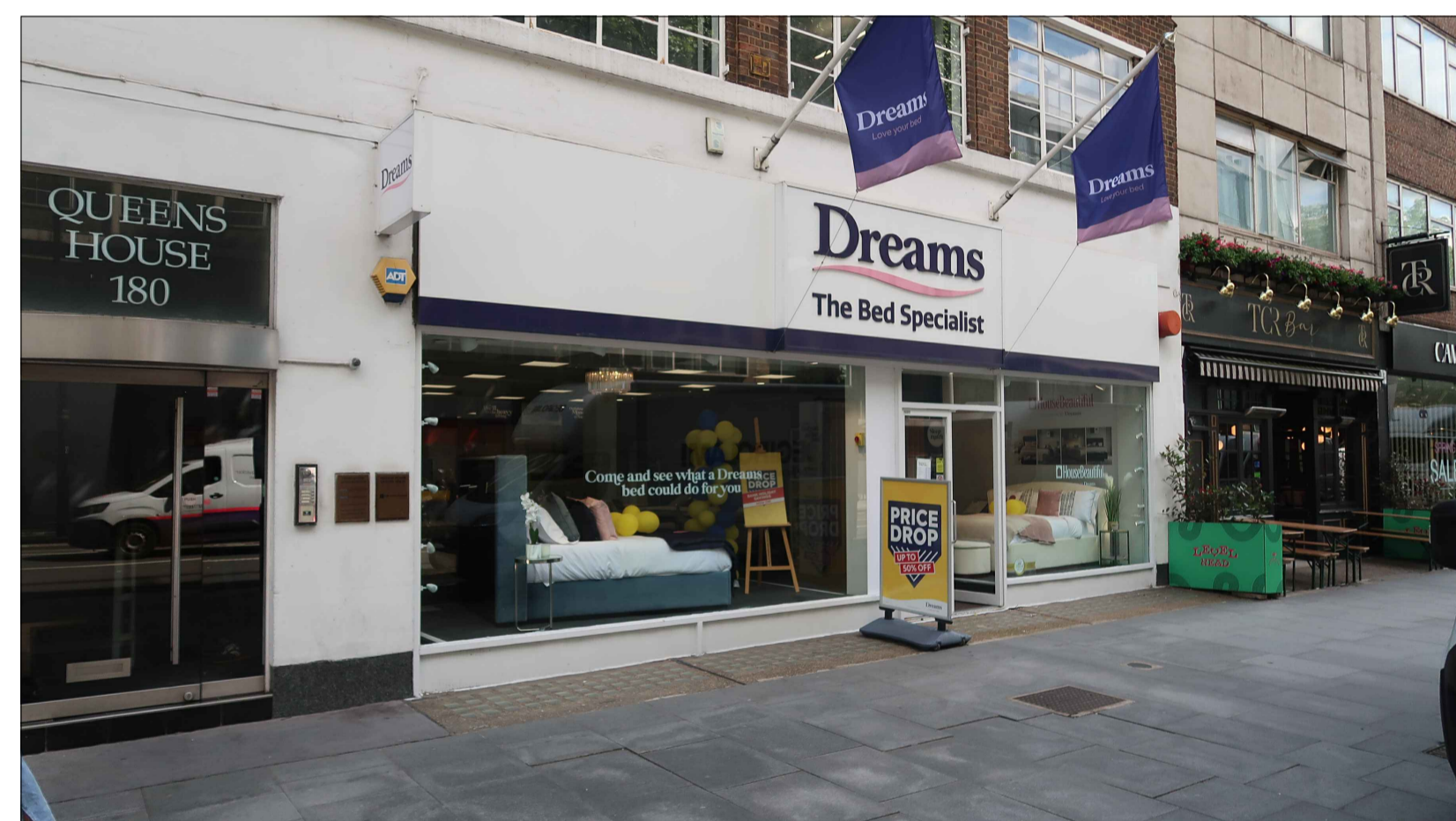
[06] Streetscene view of front entrance and adjacent shop